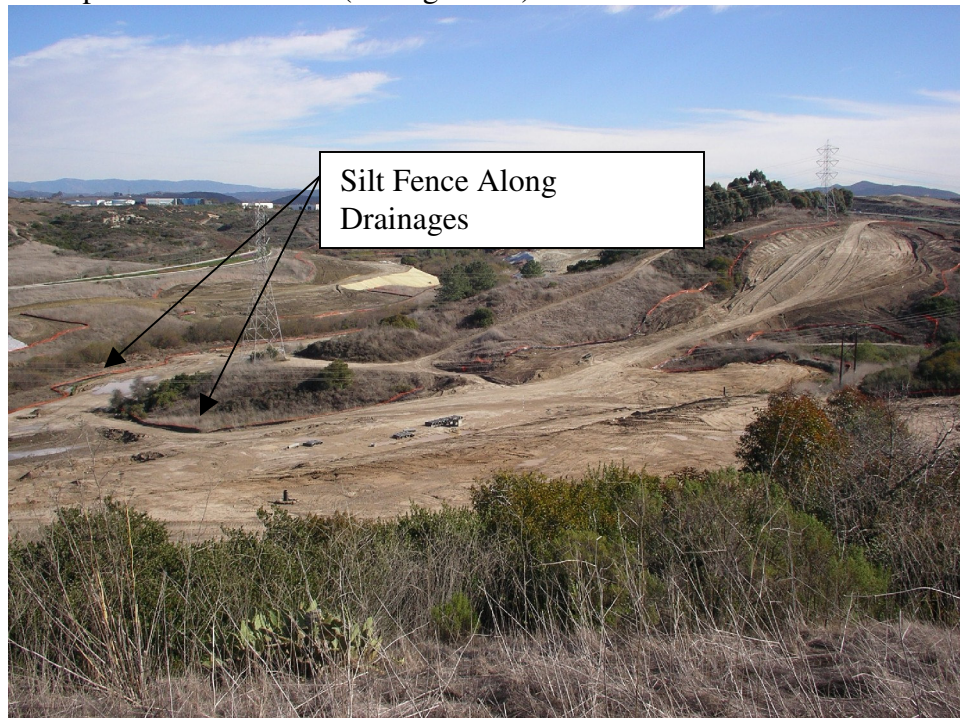
Photo 2 Example of Silt Fence Along Interior Drainages (Facing Northeast)