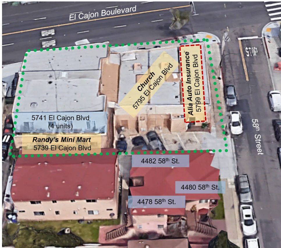
Site view from south