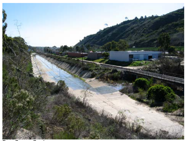
Rose Canyon Creek