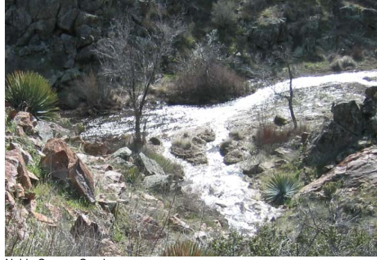
Noble Canyon Creek

Riparian and stream habitats provide natural beauty which is appreciated and valued by people. Riparian and stream habitats, especially in urban areas, are vital to enhancing our quality of life. People are far more likely to respect and be stewards of "natural" reaches of streams than channelized or artificially modified reaches. Riparian lands represent a significant value to society.