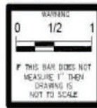
Figure is from Marine Corps Base Camp Pendleton, Part 3: Project Program, Northern Regional Tertiary Treatment Plant, Project P-1043, Request for Proposals, July 2010, Figure 3-1 on page 3-13. Figure modified by CDM/Filanc for this ROWD.