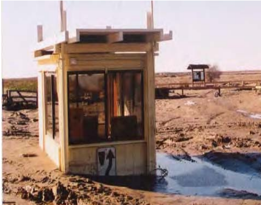
Storm events have caused up to several feet of sediment to deposit in the Tijuana River Valley.