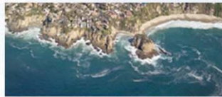
Laguna Bluebelt Coalition