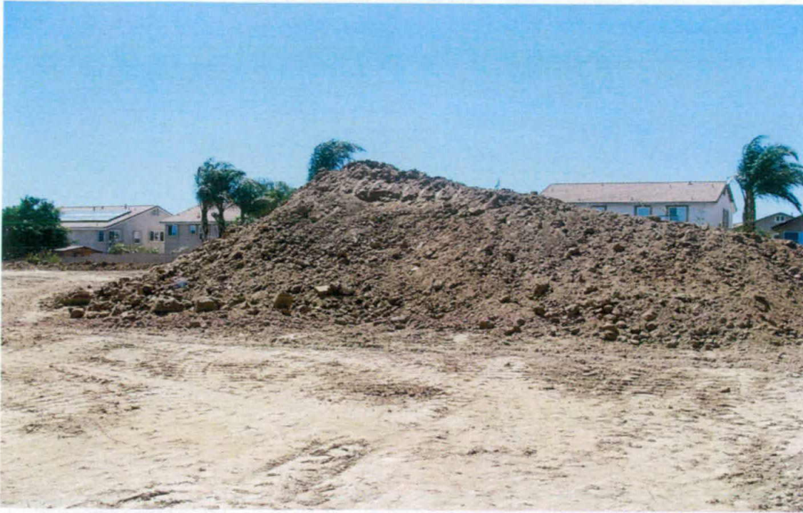
Photo 7: Large stockpile of soil is unstabilized on upper proposed residential pad. Stockpile is lacking any sediment or erosion control BMPs. Photo taken 07/03/14