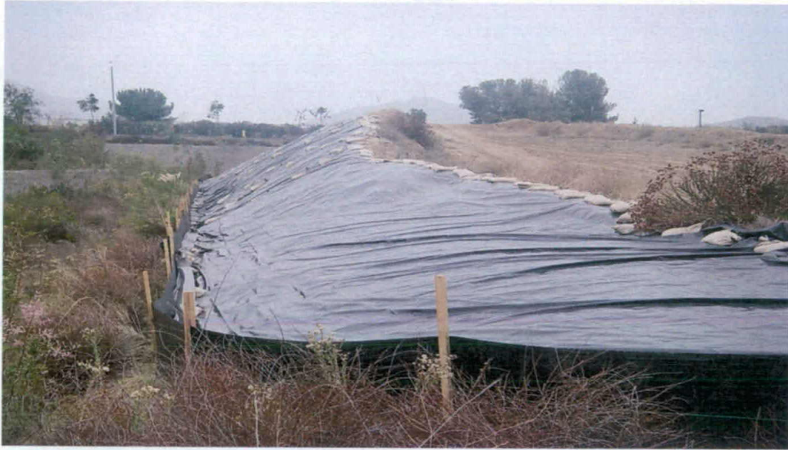
Photo 1: San Diego Water Board inspection on 10/24/13 noted a large stockpile in the northern corner of the lower portion of the site, adjacent to the mitigation area. Erosion control was in place. The City of Murrieta requested that the stockpile be removed.