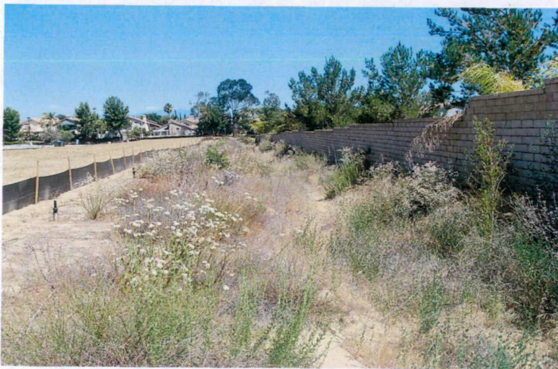
Photo 10: The southwest portion of the mitigation area is in better condition than the northern segment. Both banks of the channel are vegetated, but it is still in need of maintenance and invasive species removal in accordance with 401 certification requirements. (photo taken 07/03/14)