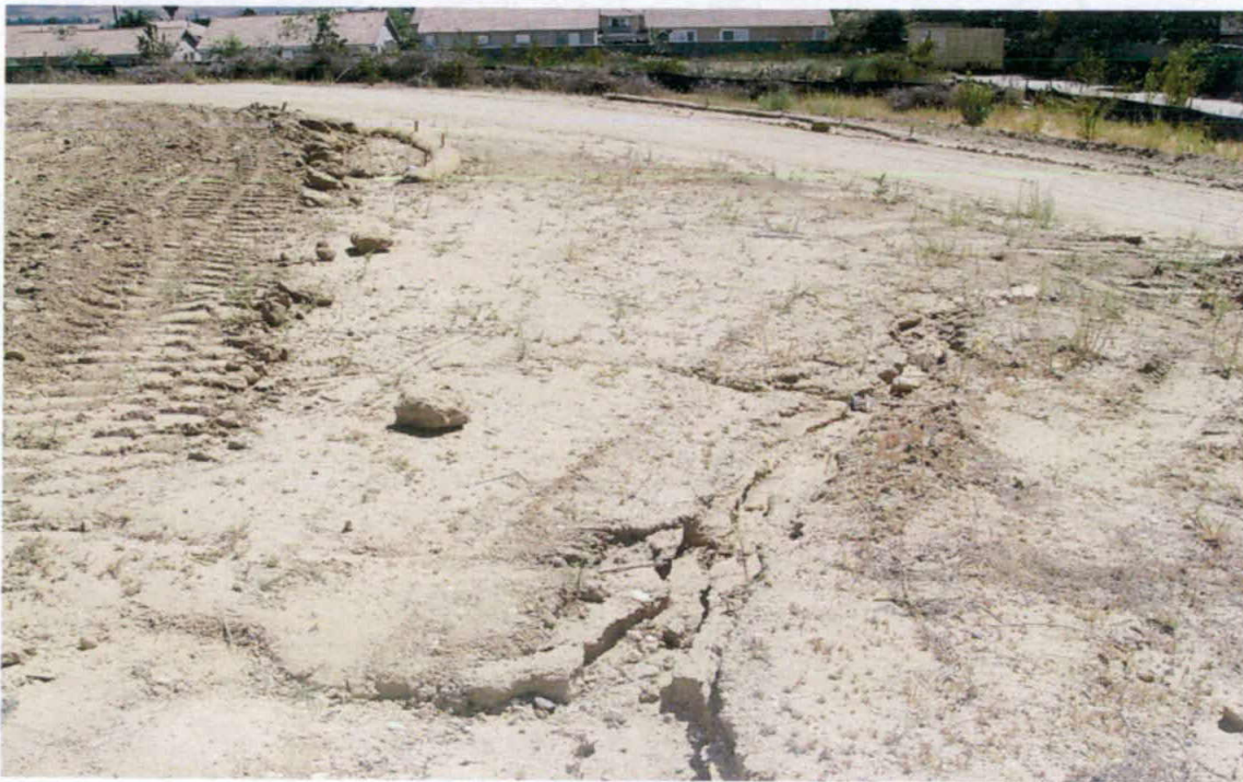
Photo 8: Rill erosion was noted on upper pad near the bend in the mitigation channel. Photo taken 07/03/14