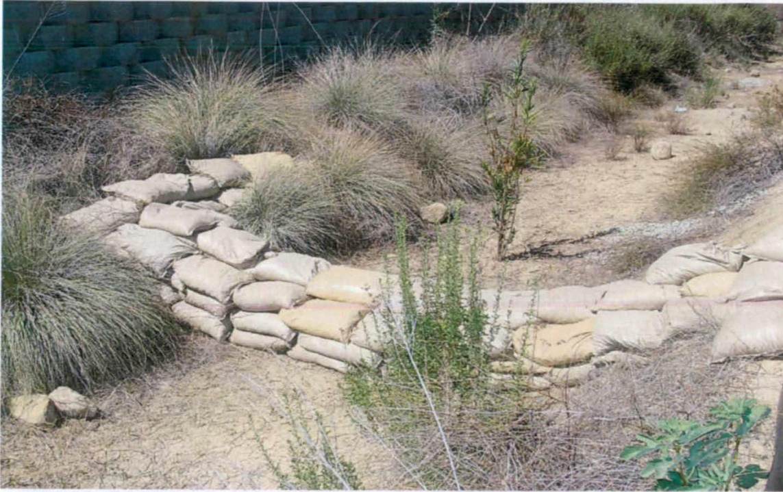
Photo 5: A gravel bag check dam of indeterminate purpose has been placed within the mitigation channel and constitutes an unauthorized discharge of fill into waters of the State.