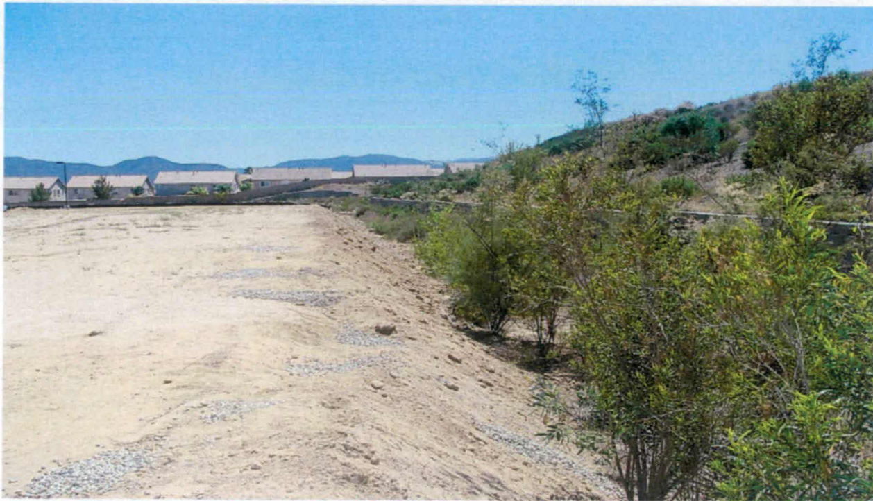
Photo 2: San Diego Water Board inspection on 07/03/14. Stockpile has been removed, lower building pad and slope adjacent to northern corner of mitigation area is devoid of vegetation and slope poses a threatened discharge of sediment to the mitigation area.

Photo 1: San Diego Water Board inspection on 10/24/13 noted a large stockpile in the northern corner of the lower portion of the site, adjacent to the mitigation area. Erosion control was in place. The City of Murrieta requested that the stockpile be removed.