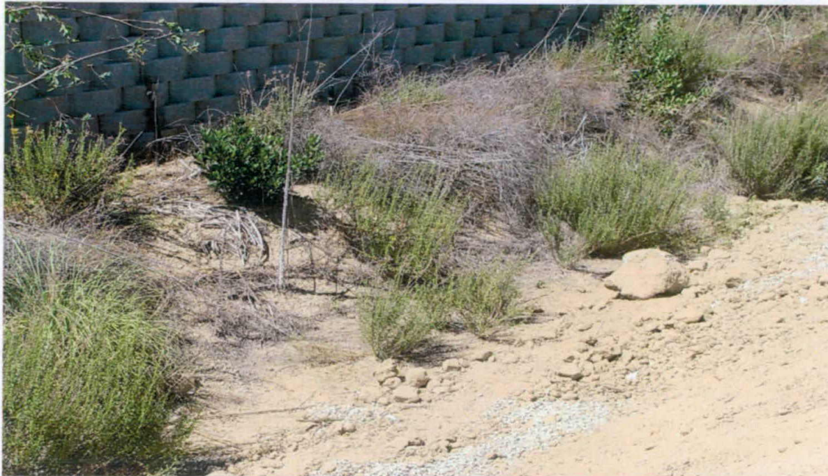
Photo 4: Photo taken 07/03/14 shows additional sediment discharge to mitigation area, including gravel from prior gravel bag sediment controls that were in place.