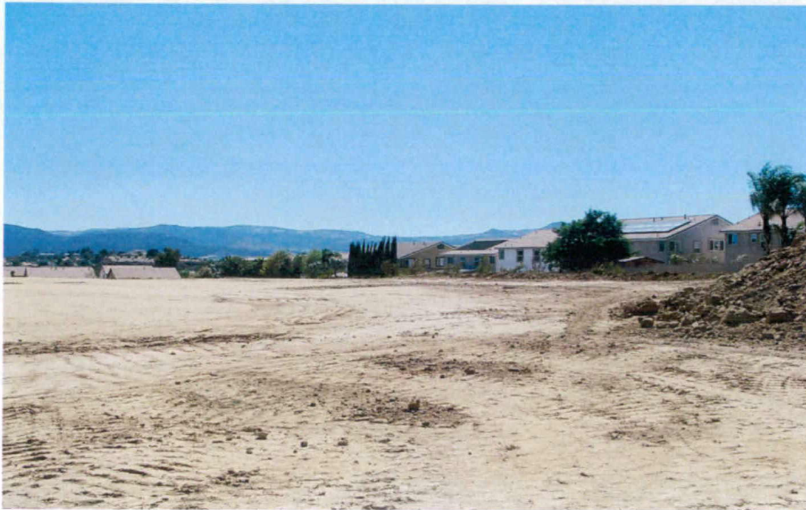
Photo 6: Upper proposed residential pad is inactive, and devoid of erosion control BMPs in violation of Order 2009-0009-DWQ and 401 certification conditions.