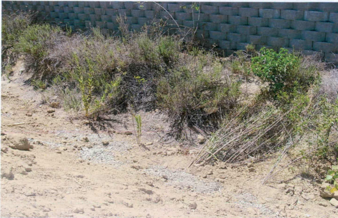
Photo 3: Stockpile removal and grading activities have resulted in sediment discharge into mitigation area and impacts to native vegetation (mulefat plantings are knocked over by sediment in this photo). These discharges of sediment are in violation of discharge prohibitions in the Basin Plan For the San Diego Region, Order 2009-0009-DWQ and 401 cert 08C-073. Photo taken 07/03/14.