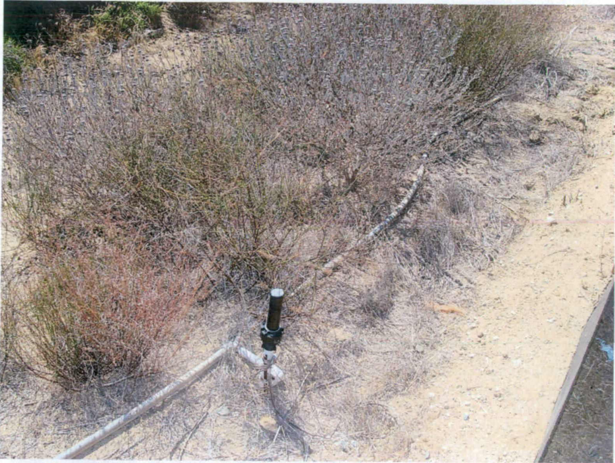
Photo 11: The southwestern portion of the mitigation area still has temporary irrigation in place, but it was not apparent that it had been used for quite some time, as piping and sprinkler heads were damaged. Irrigation and channel maintenance should resume until final success criteria in 401 mitigation plan is achieved. (photo taken 07/03/14)