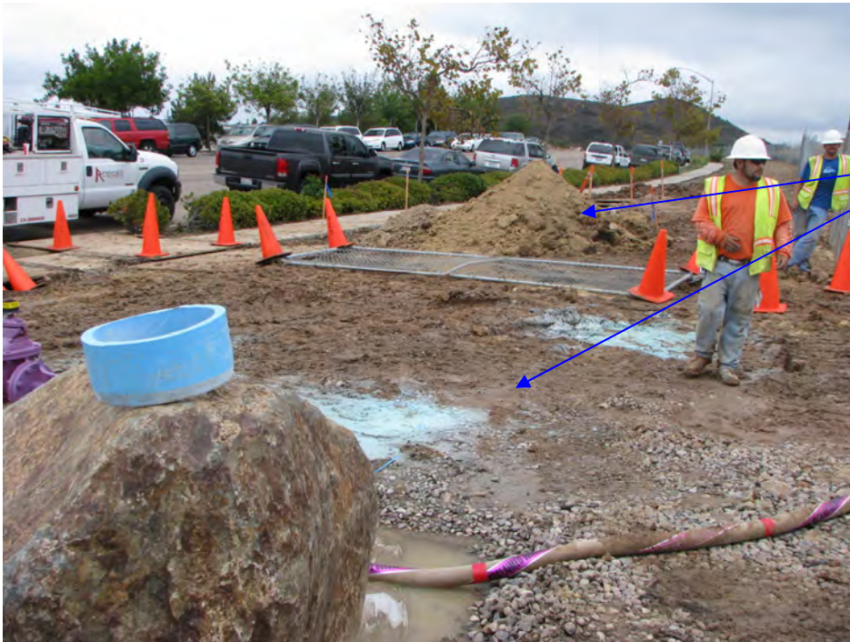
Figure 3. Uncovered slope (inside property)

Note uncovered stockpile and blue dust from pipe cutting