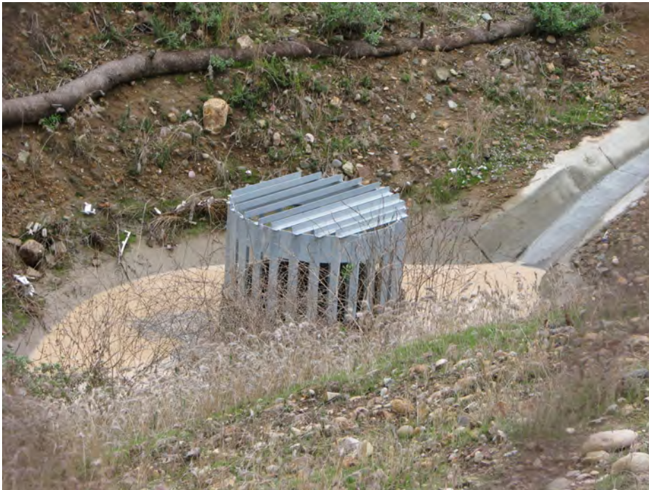
Figure 7. Storm drain inlet at North side of property

Riser pipe is wrapped with filter fabric. Note turbid water surrounding pipe entering via concrete swale.