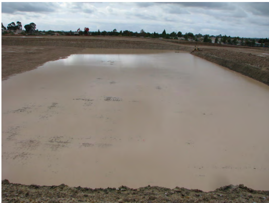
Figure 11. Pump intake

Area of construction site being dewatered.