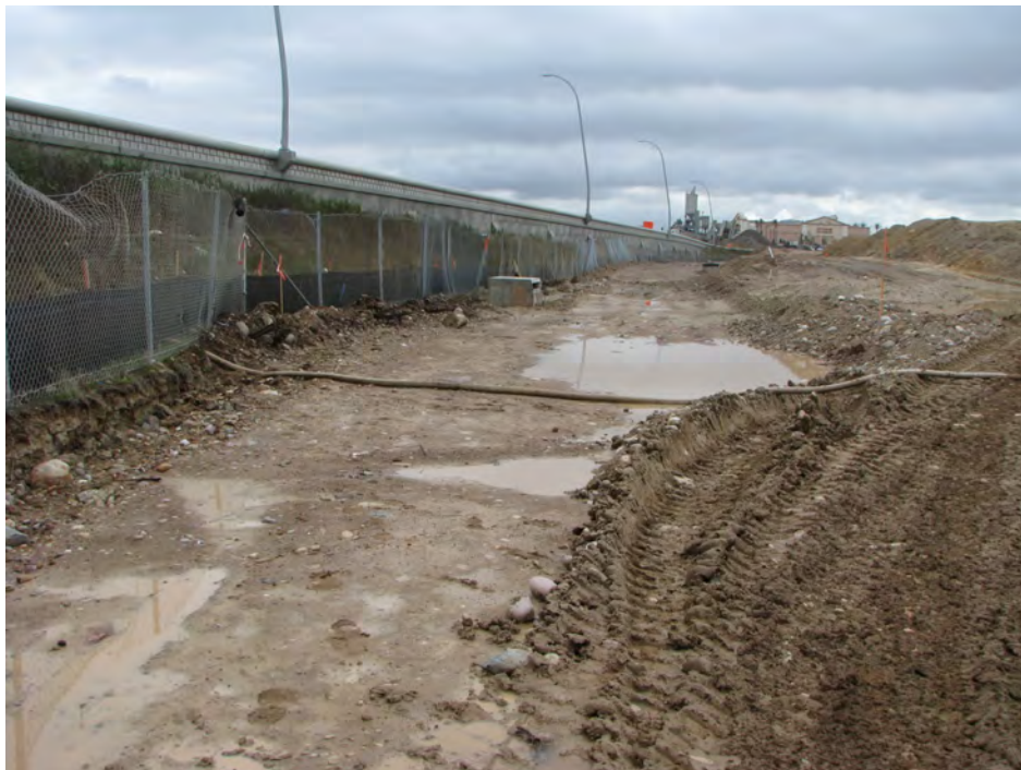
Figure 9. Outlet pipe of illegal discharge

Pipe from project site was placed through chain link fence to concrete swale.