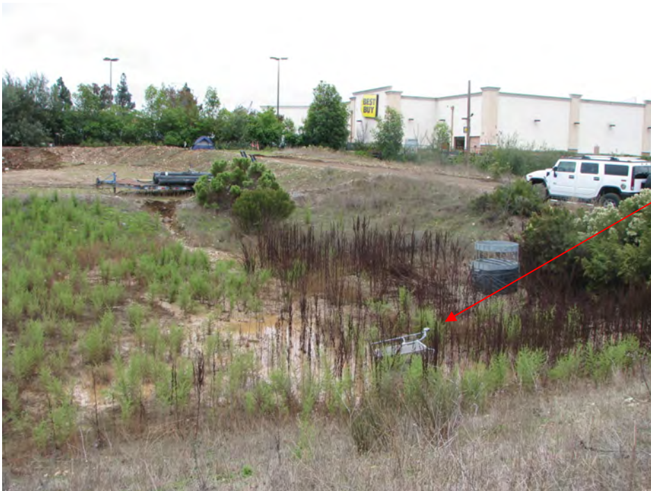
Figure 1. Construction site entrance

Shopping cart in desilting basin should be removed.