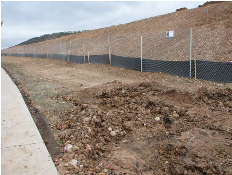
Figure 5. Sidewalk adjacent to project site

Slopes on West side (perimeter) of site have no erosion control BMPs. Also, disturbed sediment near sidewalk should be covered or removed.