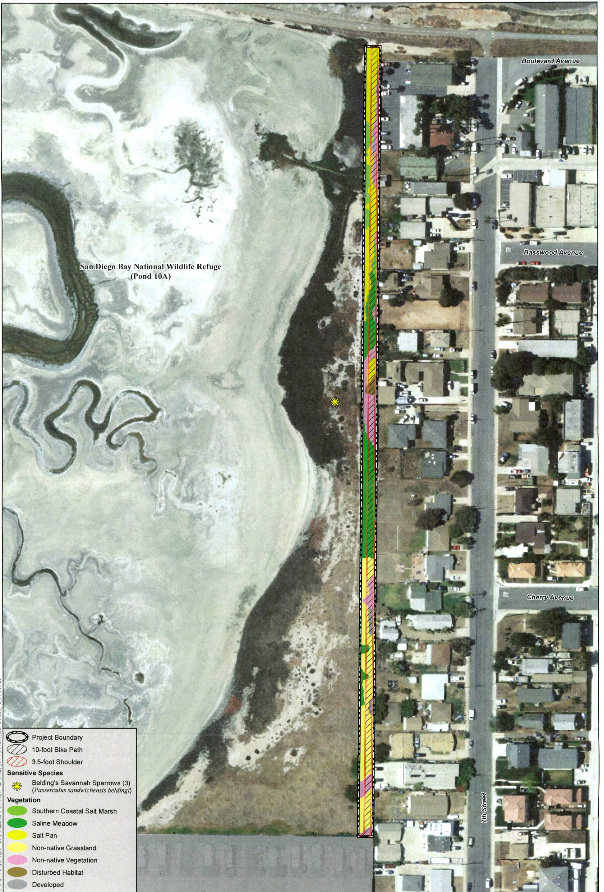
Vegetation and Sensitive Resources/Impacts (Phase II)