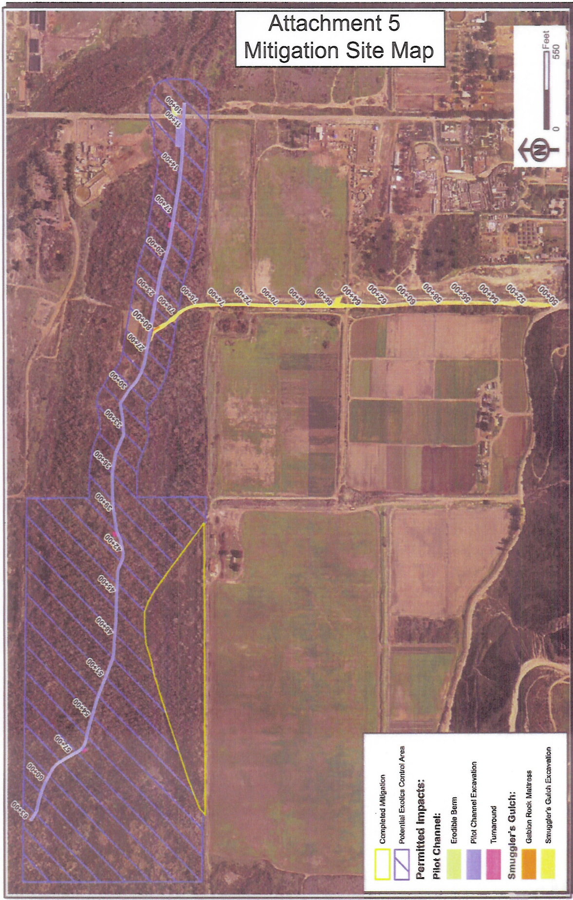
Tijuana River Valley Maintenance Project Conceptual Wetlands Mitigation and Monitoring Plan Impacts and Mitigation Map