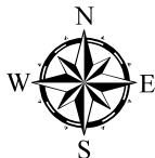
Incident Area Map Buena Vista Sewer Force Main Discharge April 2007