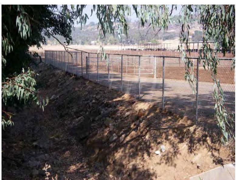
Figure D-1. Animal Exclusion Device at Konyn Dairy, Valley Center Road, San Dieguito Watershed.

However, for management of animals and animal wastes, structural controls may be required. Examples of structural controls include the installation of roof gutters to divert rain water away from manure and/or prevent erosion, or installation of vegetative strips, that absorb and filter runoff and minimize or prevent surface runoff and pollutants from reaching waters of the state. Another example includes the construction of animal exclusion devices, such as fences or other physical barriers, to keep animals out of the creeks, as shown in Figures D-1 and D-2. Figure D-1 depicts a galvanized fence that is useful for keeping dairy cows from the Konyn Dairy in Escondido, California, (background) out of the creek bed (foreground). However, this control would be more effective if set back farther from the creek bank and with a vegetative strip between the fence and the creek bank. Figure D-2 shows a similar fencing device that is useful for keeping horses confined and away from surface waters. No adverse environmental effects are expected as a result of implementing these types of structural controls.