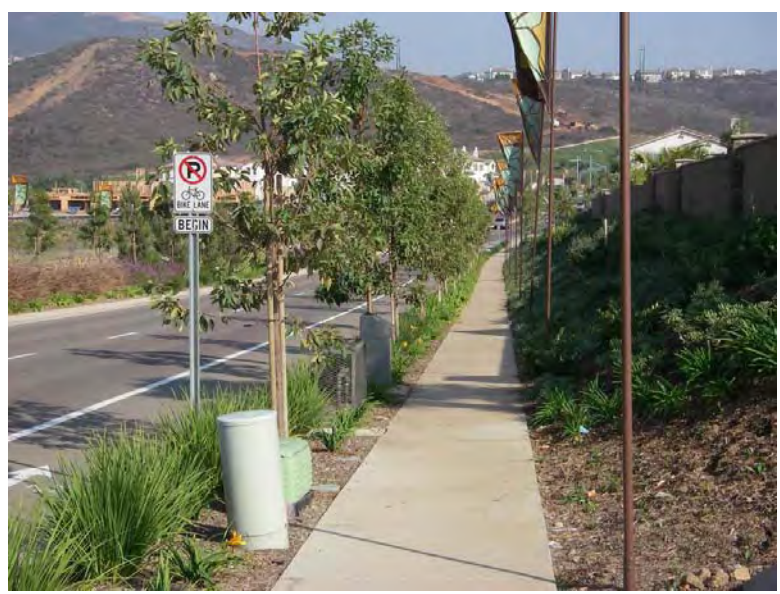
Figure D-7. Vegetative Strip in Residential Area, San Elijo Hills, Carlsbad Watershed