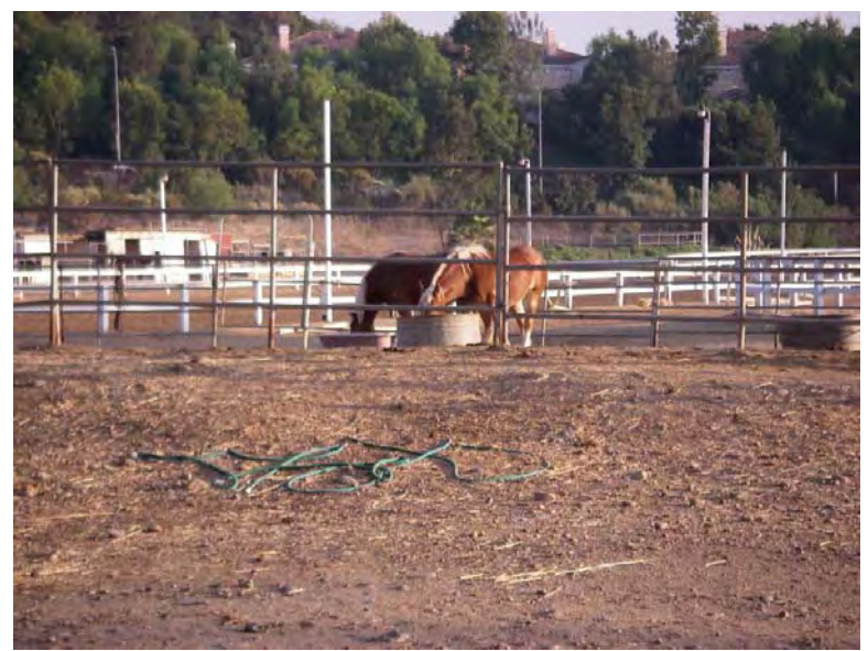
Figure D-2. Animal Exclusion Device at Happy Trails Horse Ranch, Black Mountain Road, Penasquitos Watershed.