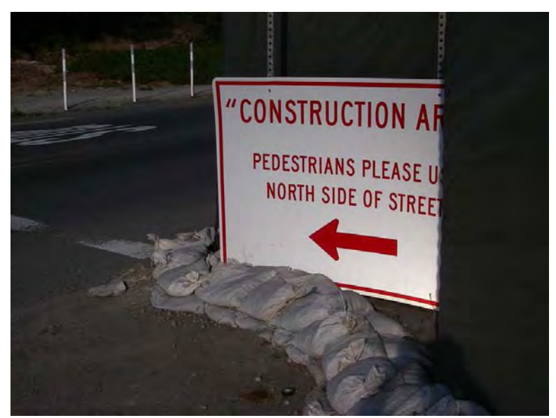
Figure D- 4. Use of Sandbags upstream of Moonlight State Beach, Encinitas Blvd., Carlsbad Watershed.