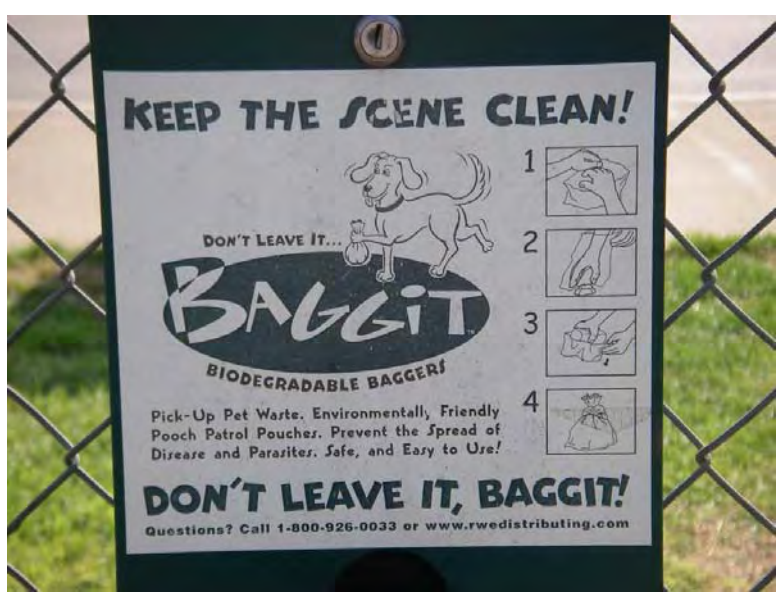
Figure D-8. Plastic Bag Dispenser at Mayflower Dog Park, Valley Center Road, San Dieguito Watershed.

Many park and recreation areas are used by animals, which can be a significant source of pollution if not properly managed. Another example of non-structural controls includes education of animal owners. Animal owners should be educated about proper management of their animal's wastes. For example, like the dog park shown in Figure D-8, a sign has been posted to encourage responsible actions by dog owners. Signs could also be posted so owners of larger pets, such as horses, are educated about how to properly manage their animals and animal wastes.