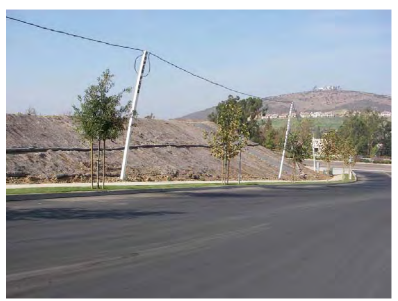
Figure D-3. Use of Netting and Fiber Rolls at San Elijo Hills Construction Site, Northstar Way, Carlsbad Watershed.