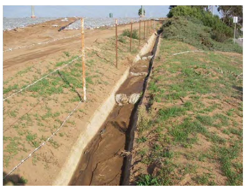
Figure D-5. Use of Sandbags near Strawberry Fields, Cannon Rd. near Interstate 5, Carlsbad Watershed.

In some cases, structural controls may be required. An example of a structural control is installing diversion or containment systems using sandbags (see Figure D-5) to prevent runoff containing pollutants from agricultural fields, such as the strawberry fields located in Carlsbad, California, (background) from reaching the storm drains that protect flooding of the adjacent roadways (foreground). Another example includes the use of vegetated swales or buffer strips between crops and any nearby surface waters.