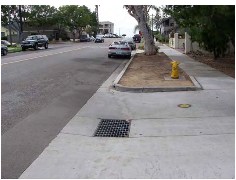
Figure D-6. Residential Area, D Street, Carlsbad Watershed

In some cases, structural controls may be required. Structural controls may include the installation of diversion systems using sand bags, which could be placed around a storm sewer inlet, such as the one shown in Figure D-6. Residential areas are often constructed with vegetated swales or buffer strips (e.g., lawns and landscaping) which can reduce the velocity of runoff, increase infiltration, and prevent pollutants from entering storm water drainage pathways or surface water, as shown in Figure D-7.