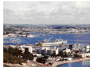
San Diego Bay

discharges of wastewaters and/or heat must be sufficiently removed spatially from these areas to assure the maintenance of natural water quality in the area. Existing wastewater and/or heat discharges which influence the natural water quality in the designated areas must be phased out as promptly as possible. Both the Thermal and Ocean Plans recognize and refer to " Areas of Special Biological Significance " in coastal waters of the state.