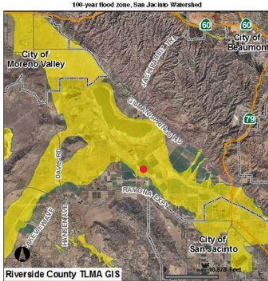
Exhibit 1 Site Vicinity Map San Jacinto River Watershed 100-year Floodplain Limit