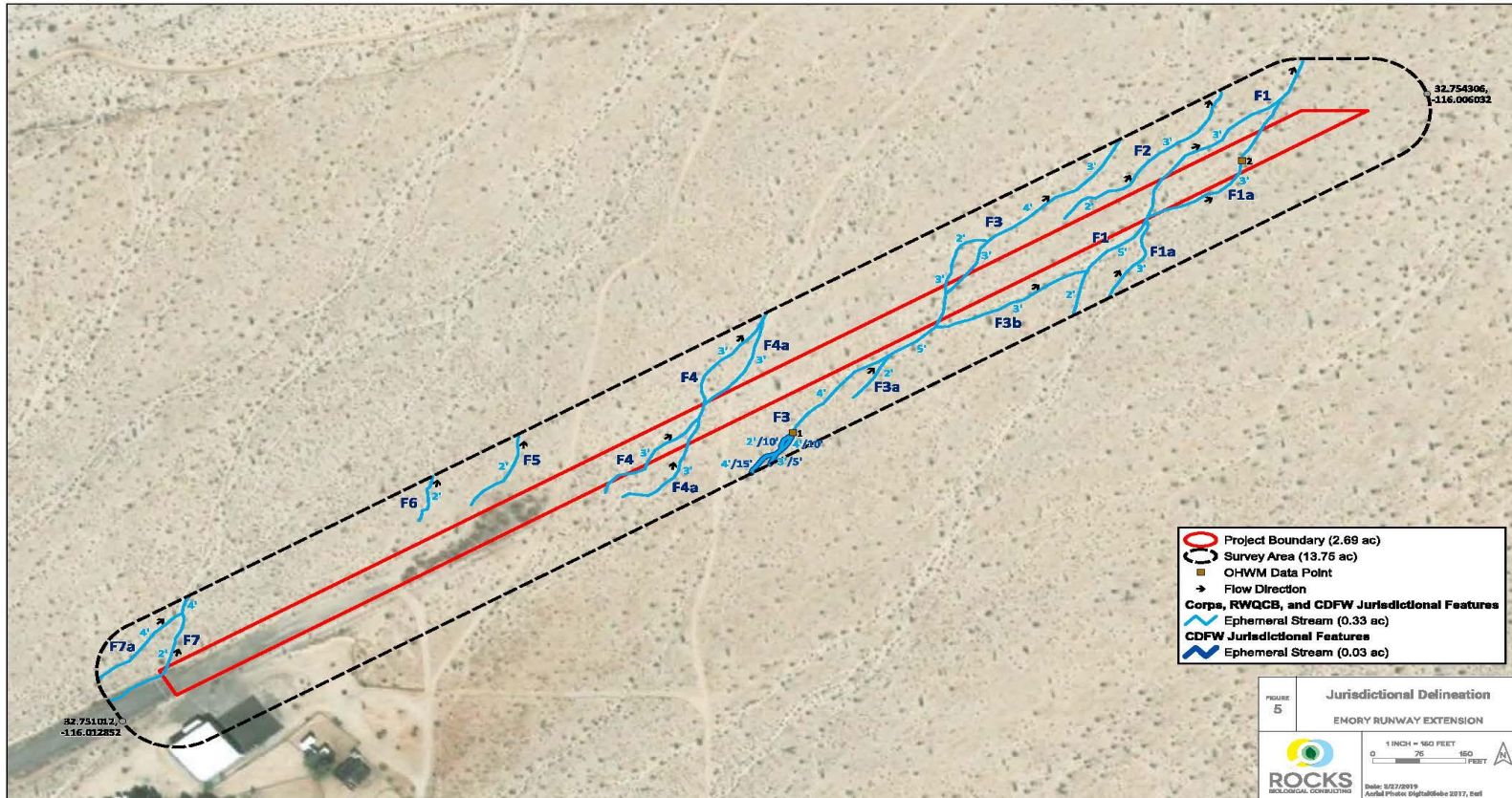
Figure 3 Jurisdictional Delineation