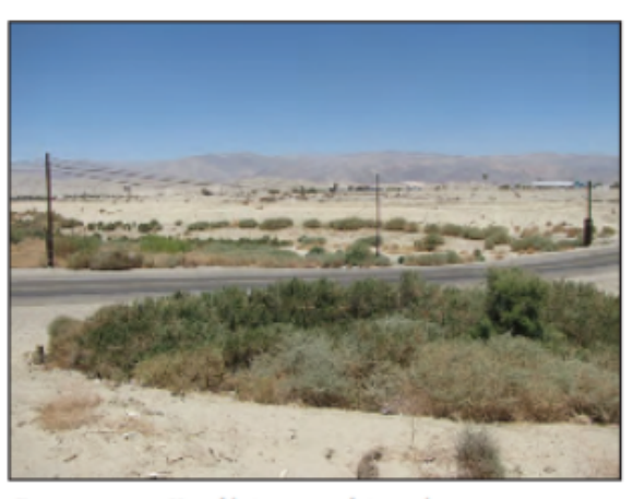
PHOTOGRAPH 4: New of drainage as seen facing northeast.