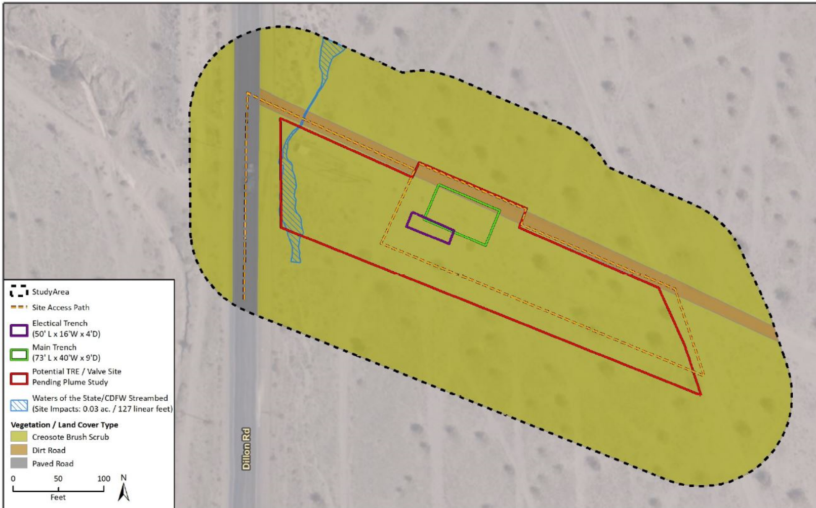
Figure 3. 1-Dillon Project Area and Jurisdictional Delineation (Rincon Consultants Inc., 2021 2 ).