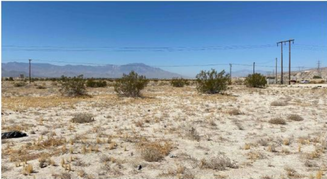
Photograph 1. View of existing SoCalGas facility and conditions within the proposed work areas. Photograph taken facing west. October 2, 2020.