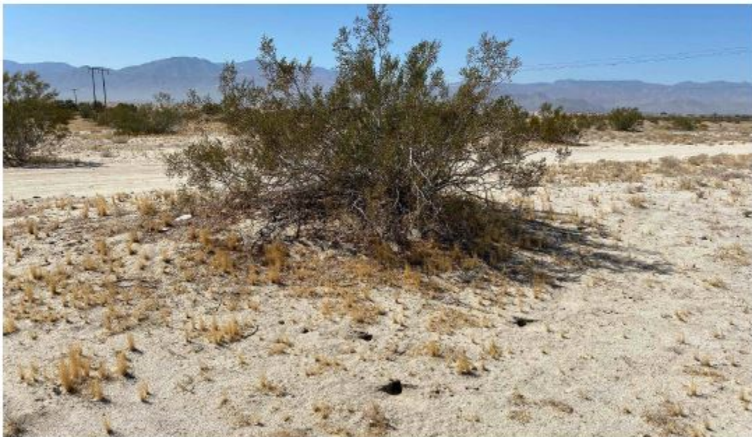
Photograph 2. View of creosote brush scrub vegetation and unpaved road within Project Area. Photograph taken facing southwest. October 2, 2020.