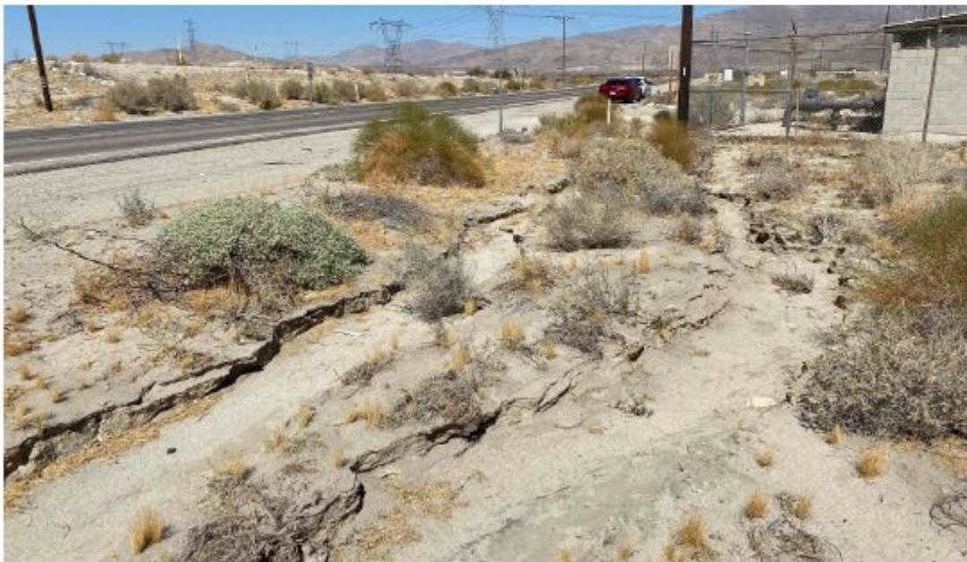
Photograph 4. View of existing SoCalGas facility and west bank east of Dillon Road. Photograph taken facing northwest. October 2, 2020.