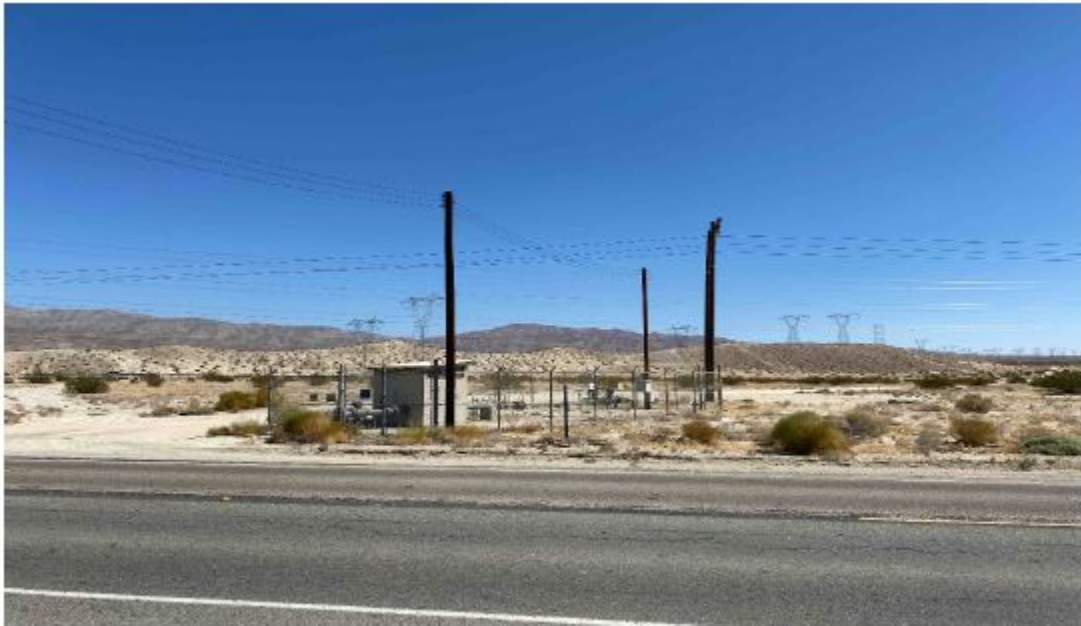
Photograph 5. View of existing SoCalGas facility facing east across Dillon Road. October 2, 2020.