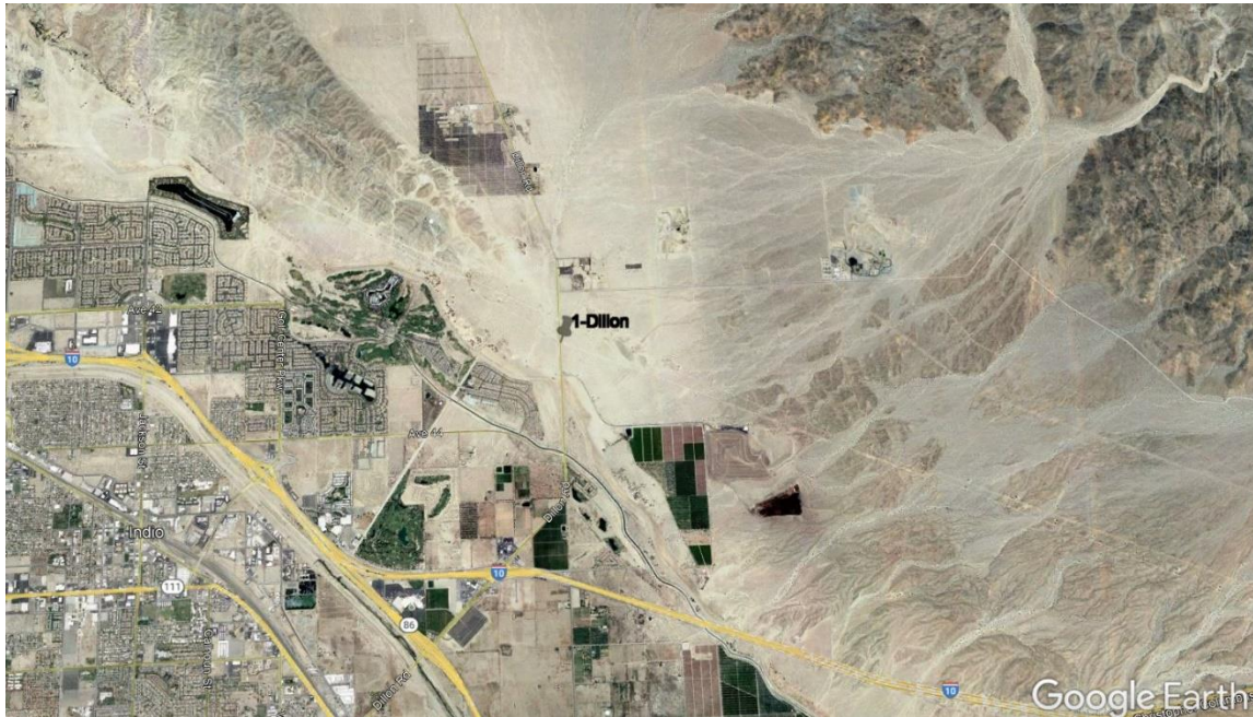
Figure 1. Regional map image depicting Project location. 1