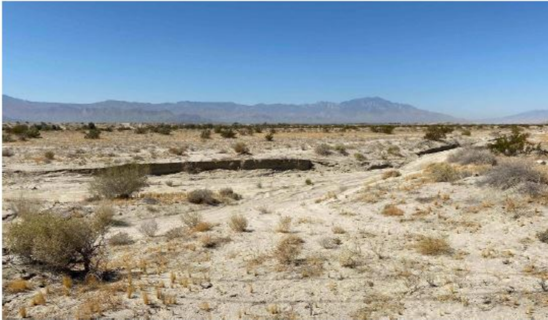
Photograph 3. View of east bank, north of Project Area. Photograph taken facing southwest. October 2, 2020.