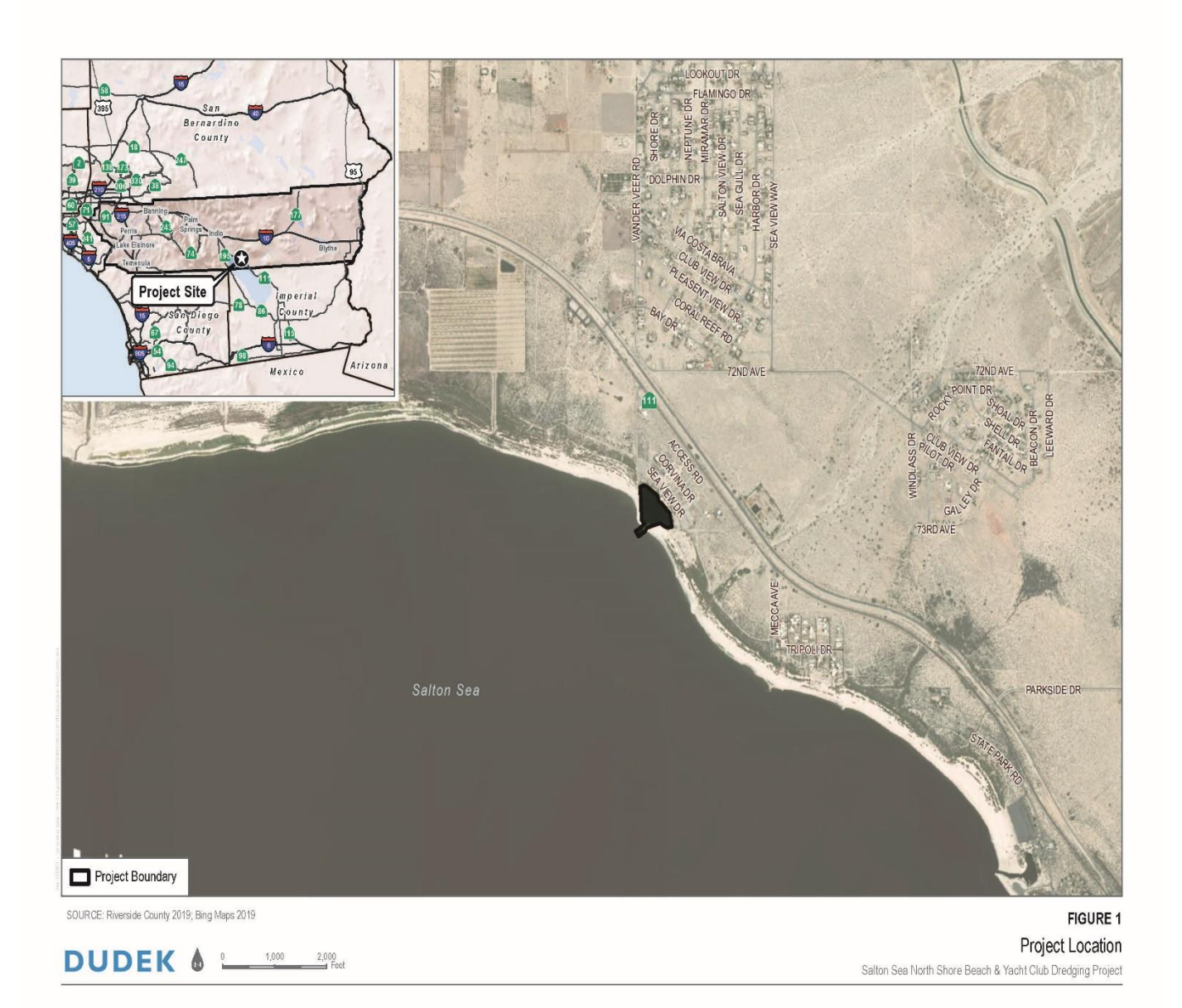
Figure 1 Project Location