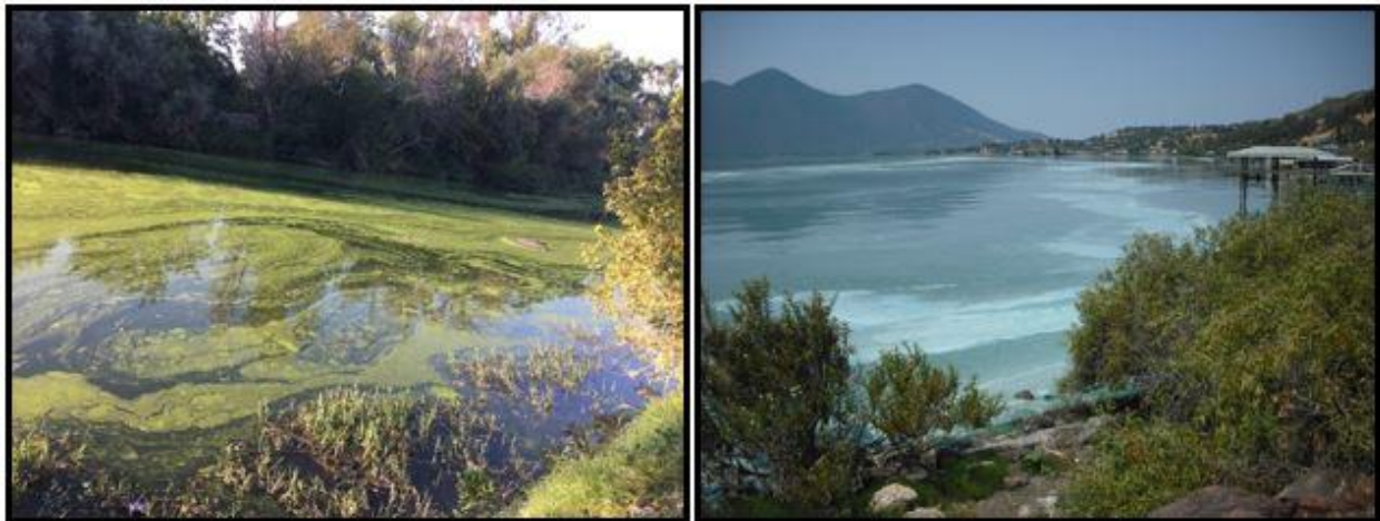
Figure 1. HAB events in Cache Creek and Clear Lake

Cyanobacteria are a group of microorganisms that exist in all aquatic environments. Under the right environmental conditions, they can rapidly multiply (i.e., "bloom") to high densities. This bloom can overtake a waterbody and outcompete the other aquatic community members for resources. Blooms can discolor the water, cause noxious taste and odor issues, and form unsightly surface scums (Figure 1). In some cases, these cyanobacteria blooms can produce harmful toxins. These types of events are referred to as harmful algal blooms (HABs). HABs have become an increasing problem worldwide. Water quality issues related to HABs have been identified in all 50 states and HAB events appear to be increasing in frequency, duration and intensity (GAO, 2016; WHOI, 2016).