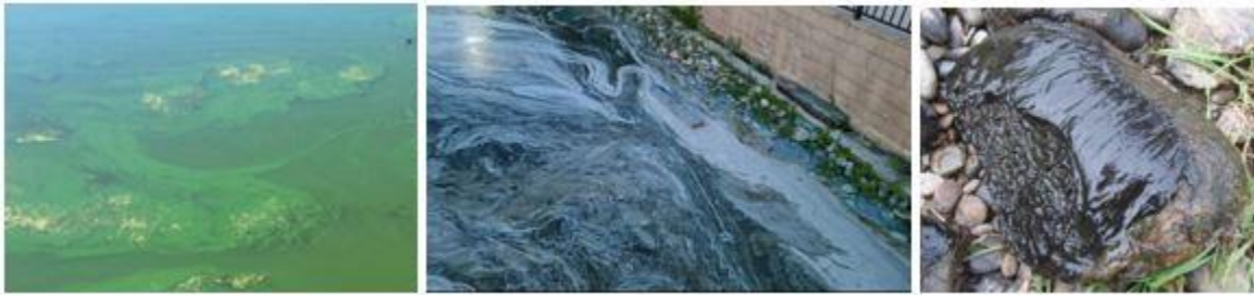
Figure 3. Surface blooms discolor the water; benthic cyanobacteria mats cover the substrate

Planktonic blooms, which are found within the water column, can discolor the water and form surface scums and mats that appear in multiple colors such as white, green, yellow, red and blue. Benthic cyanobacteria form mats on the bottom substrate (e.g. mud, sand, cobbles), or can be attached to rocks and submerged vegetation along the shoreline. Benthic blooms do not discolor the water. Figure 3 shows how the appearance of the two differs.