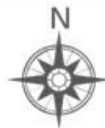
Figure Reference: Google Earth, 2018