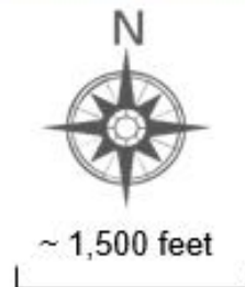
Figure Reference: Google Earth, 2018