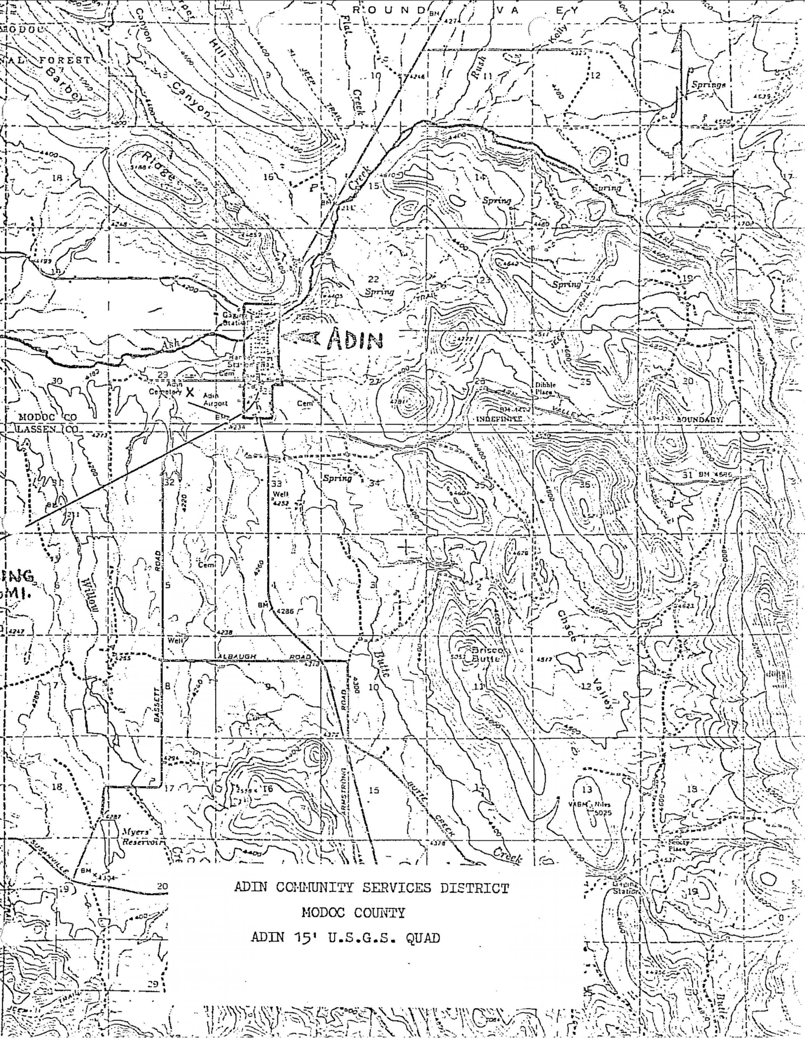
ADIN COMMUNITY SERVICES DISTRICT MODOC COUNTY ADIN 15' U.S.G.S. QUAD