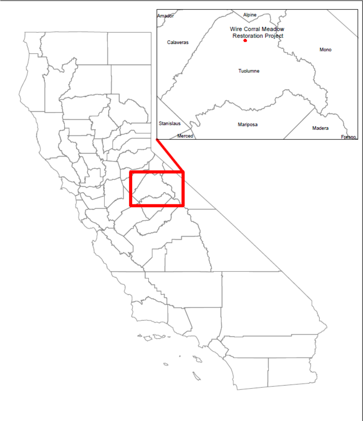
Wire Corral Meadow Restoration Project Figure 1: Location Map