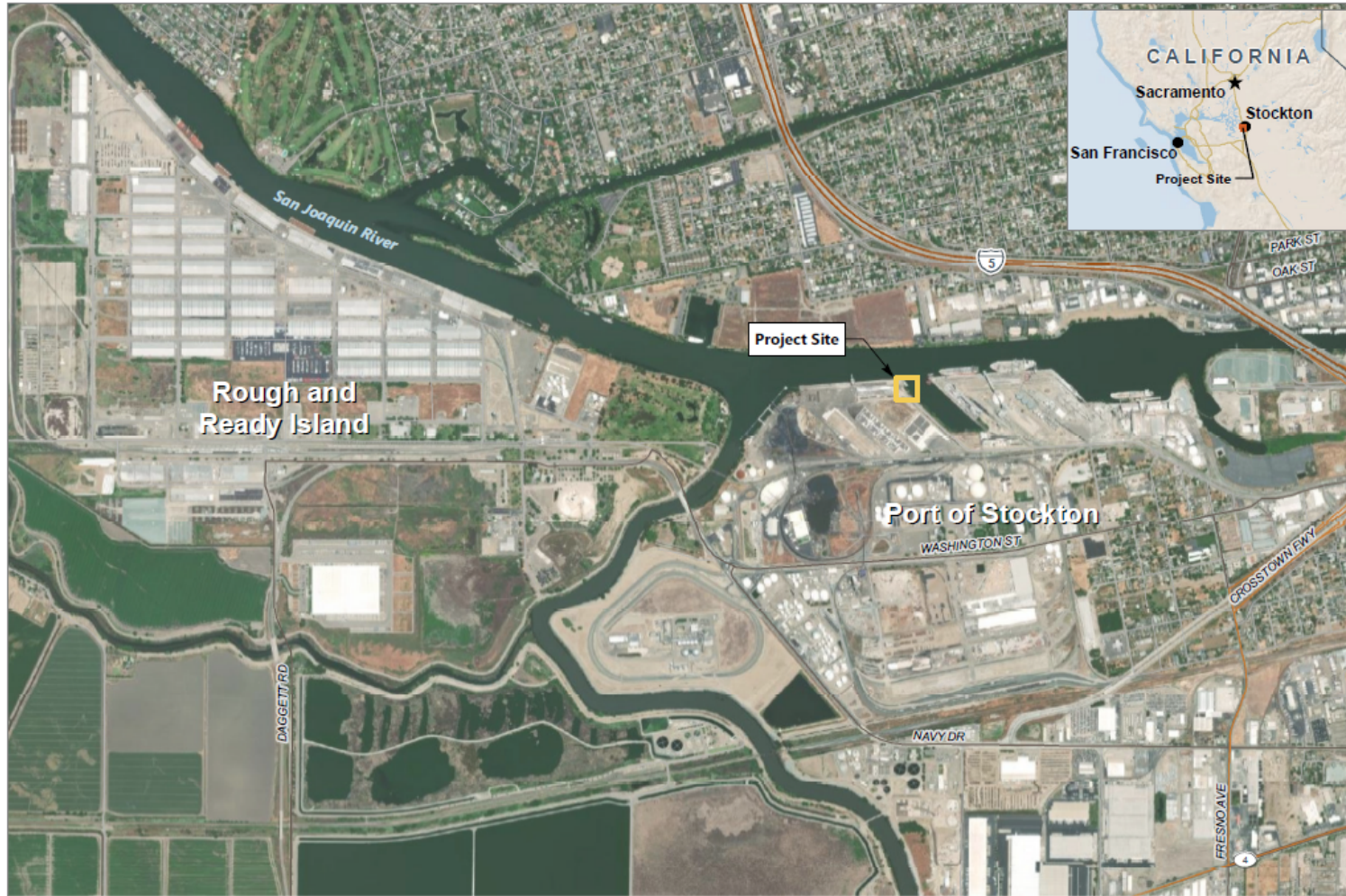
Figure 1 – Site and Vicinity Map

Publish Date: 2021/10/11, 3:36 PM | User: jsfox Filepath: \\orcas\GIS\Jobs\Port_of_Stockton_0377\Maps\EnvironmentalSupport\Police_Boat_Ramp\AQ_PoliceBoatRamp_SiteAndVicinityMap.mxd