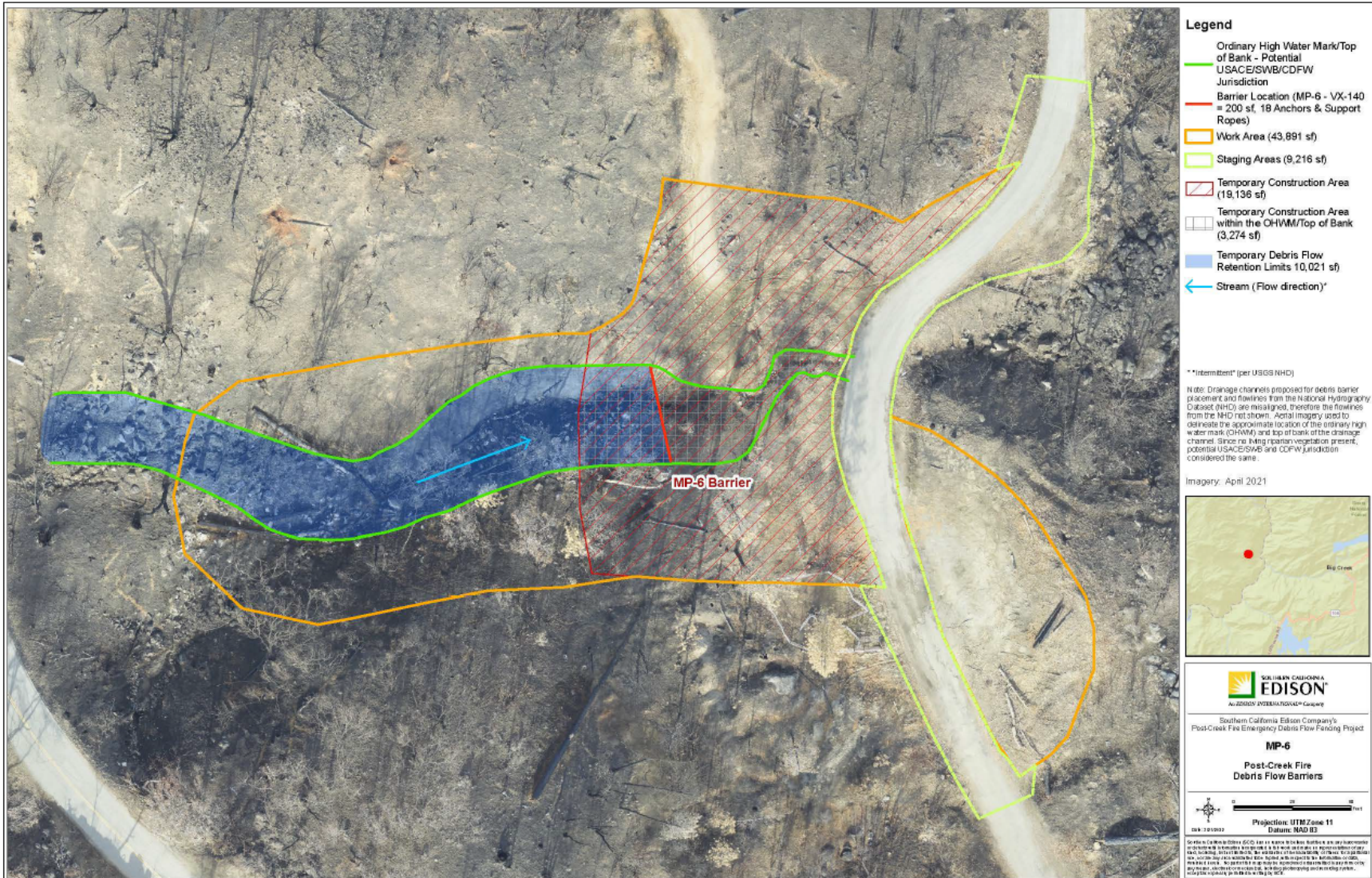
Figure 8: MP-6 Work Area and Impacts