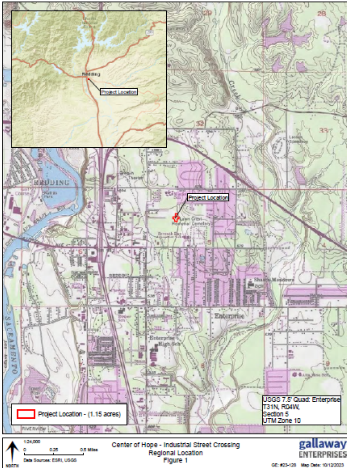
Figure 1: Project Regional Location