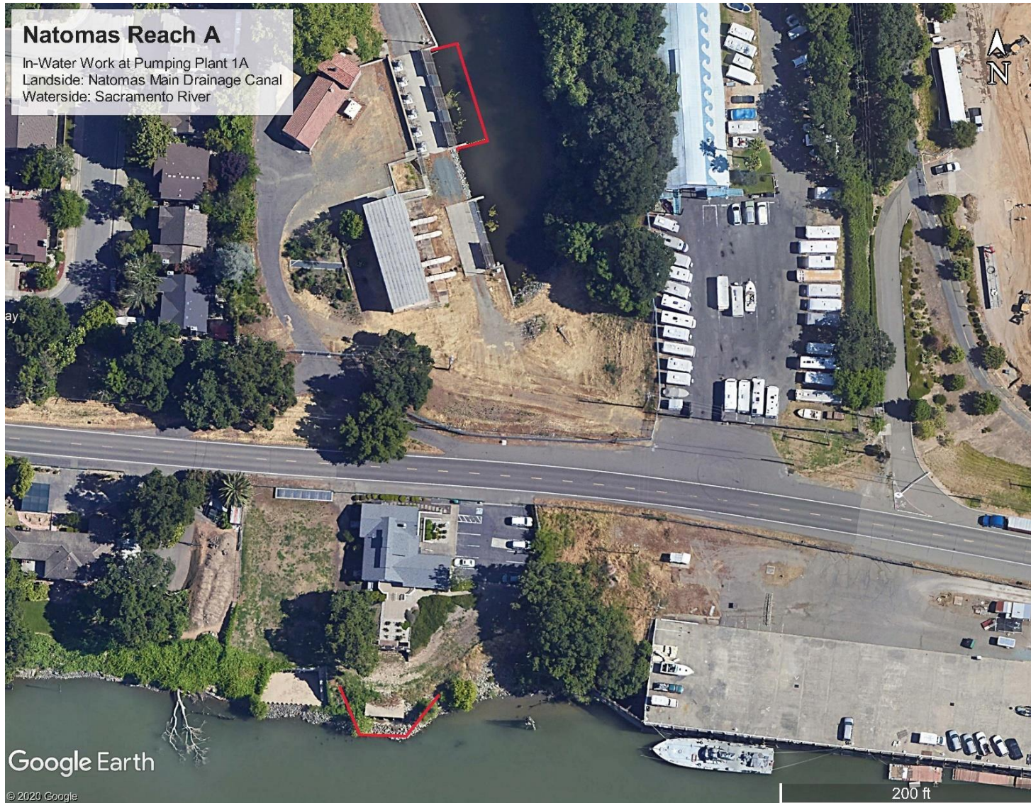
Figure 2 Impacts to Waters of the State