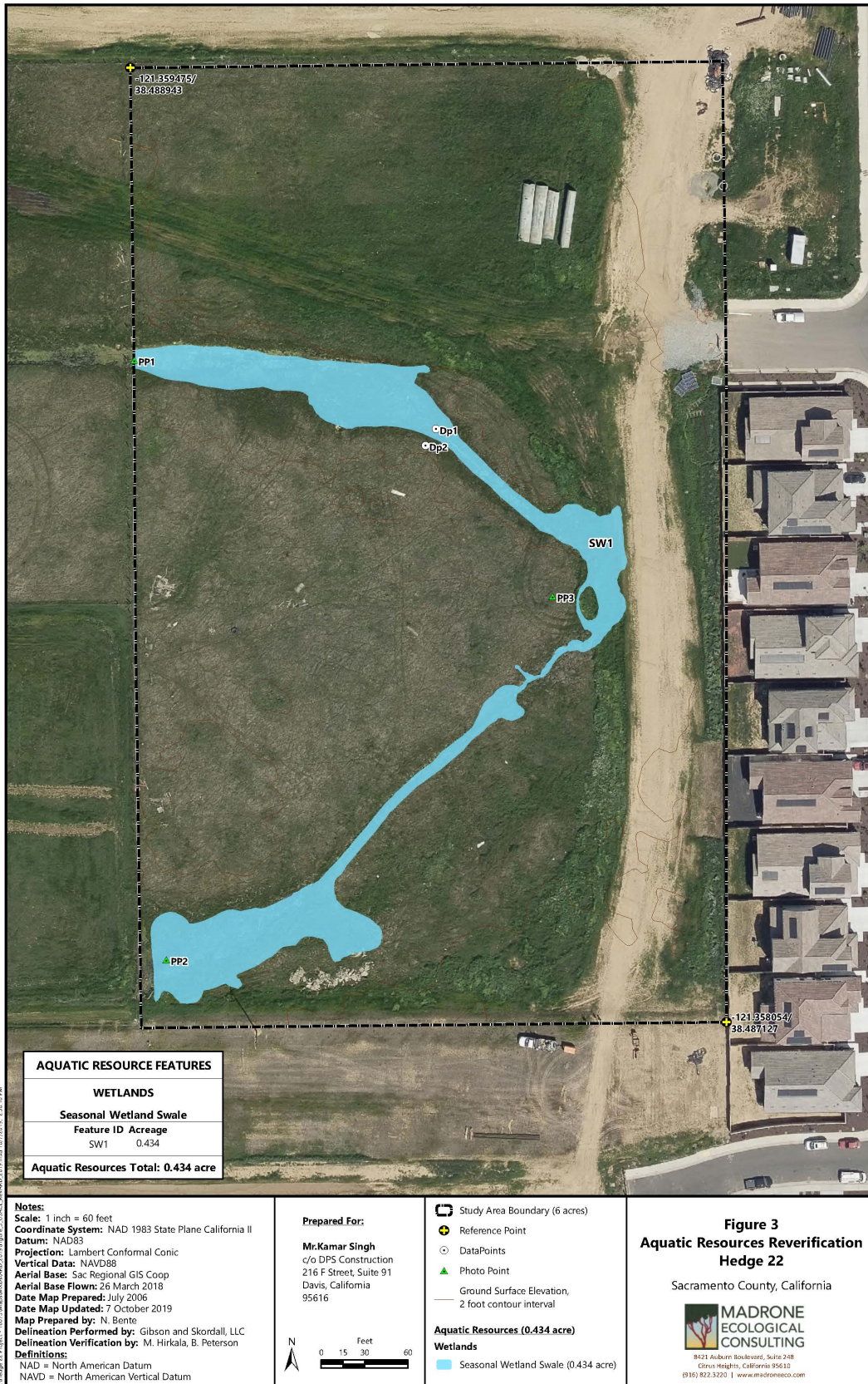
Figure 2: Site Impact Map