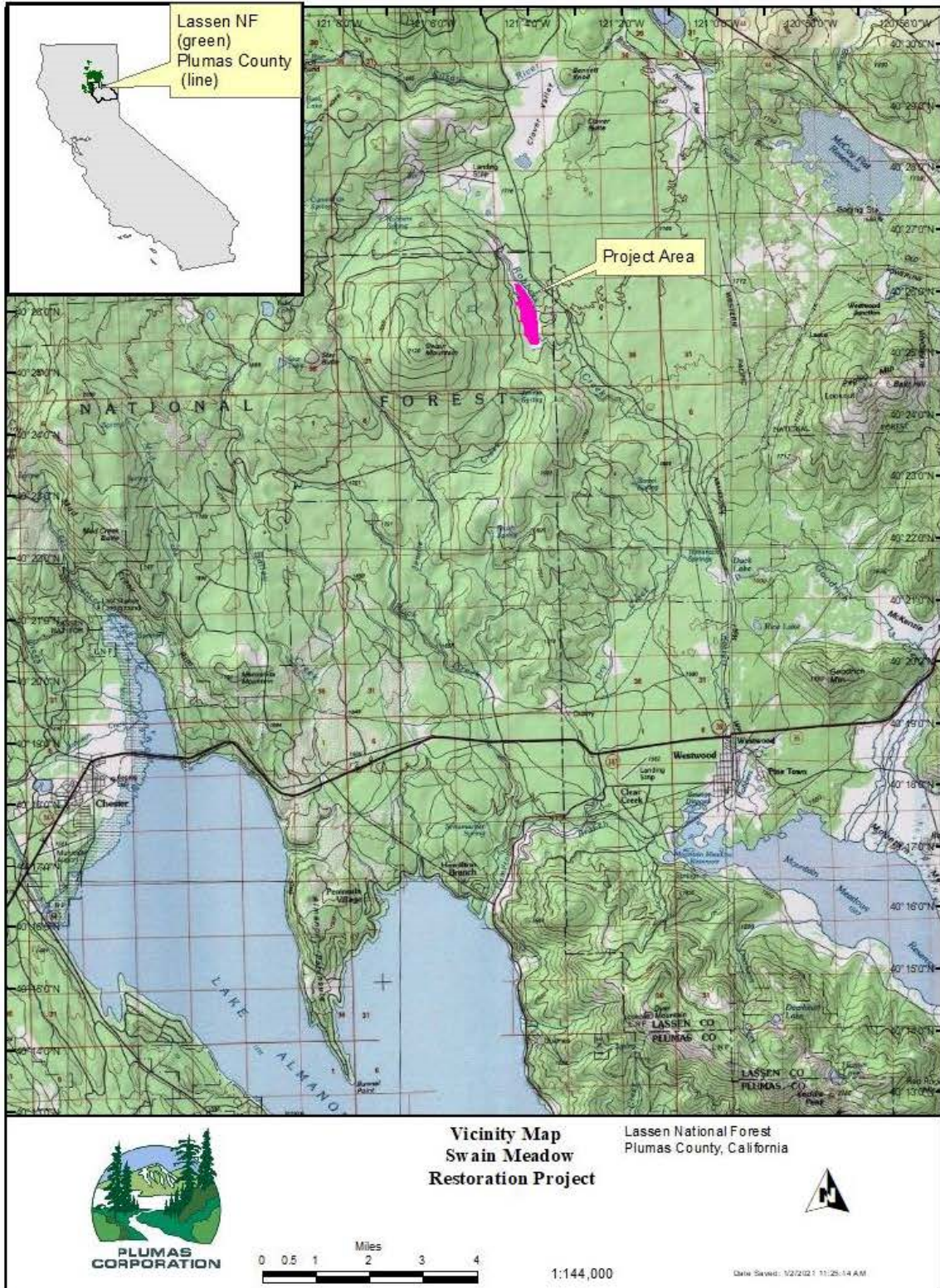
Figure 1. Vicinity Map.