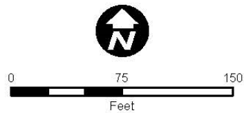
Figure 2 Rock Creek Bridge Crossing State Route 49 Sidewalk Gap Closure Project Auburn, California

OHWM = Ordinary High Water Mark Basemap Source: Google Earth Pro