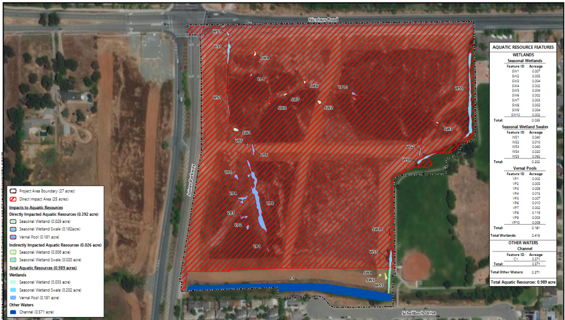
Figure 2 – Project Site Map