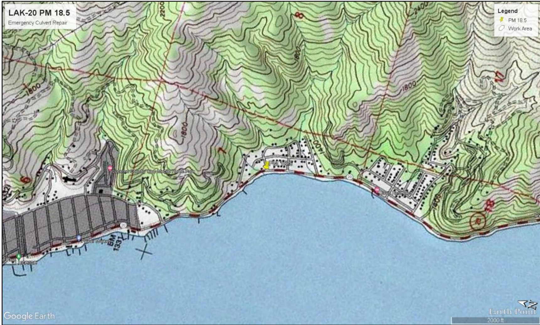
Figure 1. Project Location Map