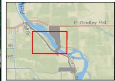
Figure 3. Impacts to Waters

2020-117 Gridley Feather River Sewer Crossing