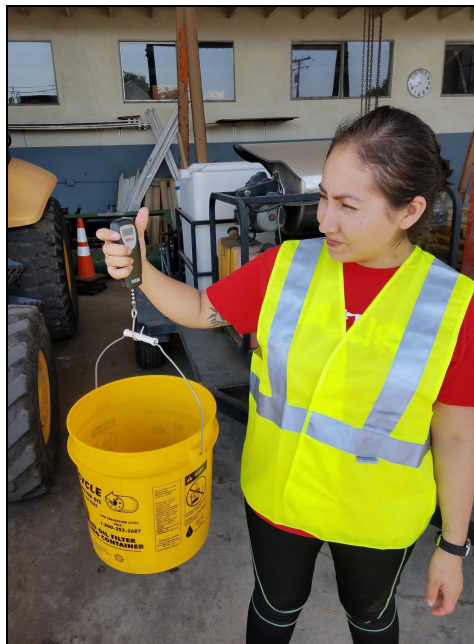
Figure 5. DGR crew member weighing collected trash using a digital scale.