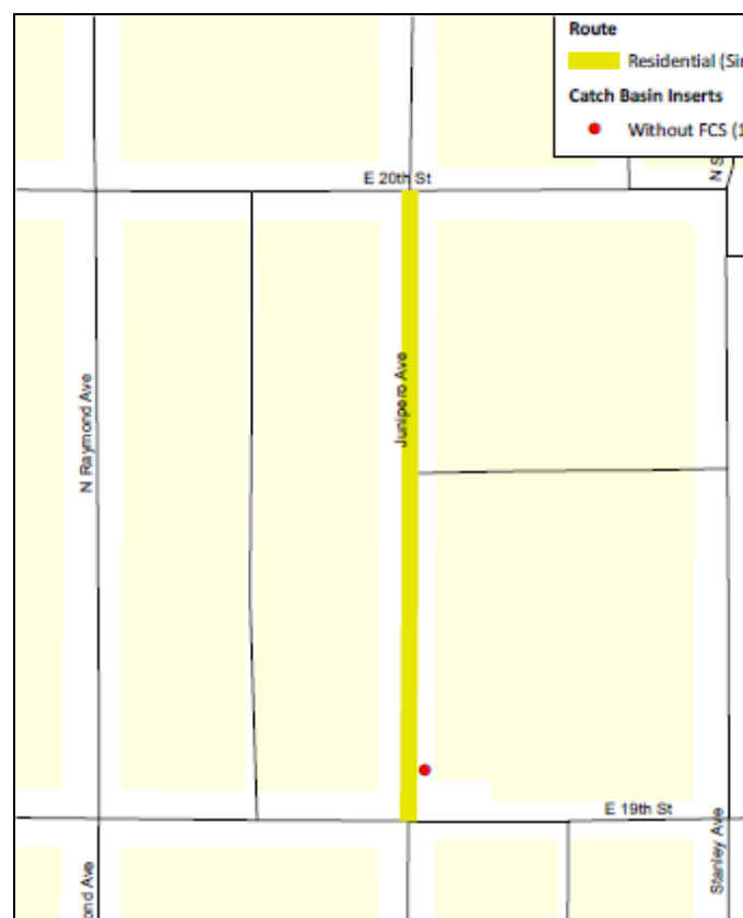
Figure 1. Residential Area Route. Collection occurred Monday. Route includes the side of the street swept Tuesday only.

Figures 1-2 show the collection routes for the DGR Study. Each figure includes a brief description.