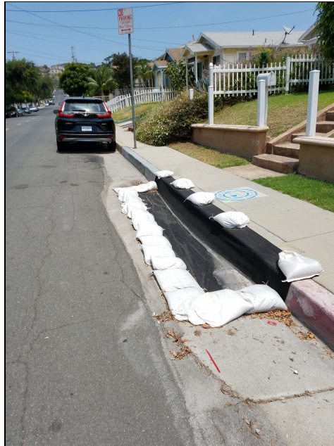
Figure 4. Catch basins along the study routes were covered to prevent trash from being swept into them.