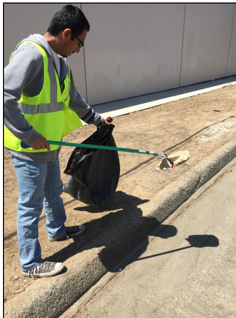
Figure 3. DGR crew member collecting trash using a reaching tool.

Figures 3-6 were taken during the 2017 DGR study. Each picture includes a brief description.