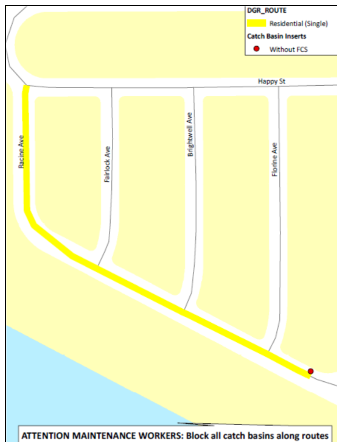
Figure 1. Residential Area Route. Collection occurred Monday. Route includes the side of the street swept Tuesday only.

Figures 1-3 show the collection routes for the DGR Study. Each figure includes a brief description.