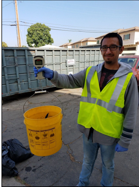
Figure 6. DGR crew member weighing collected trash using a digital scale.