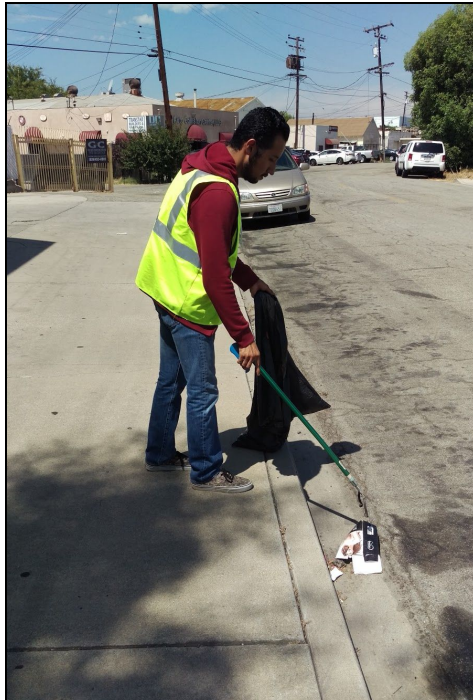
Figure 4. DGR crew member collecting trash using a reaching tool.

Figures 4-7 were taken during the 2017 DGR study. Each picture includes a brief description.