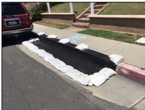
Figure 5. Catch basins along the study routes were covered to prevent trash from being swept into them.