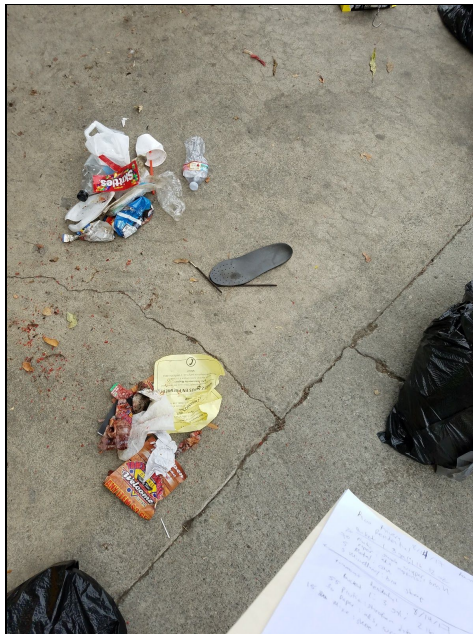
Figure 7. Sorted trash pile from the Residential Area route on 8-14-17.