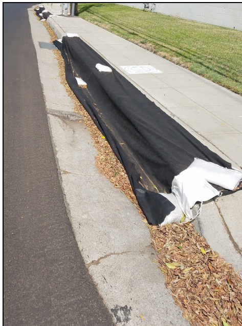
Figure 8. Catch basins along the study routes were covered to prevent trash from being swept into them.