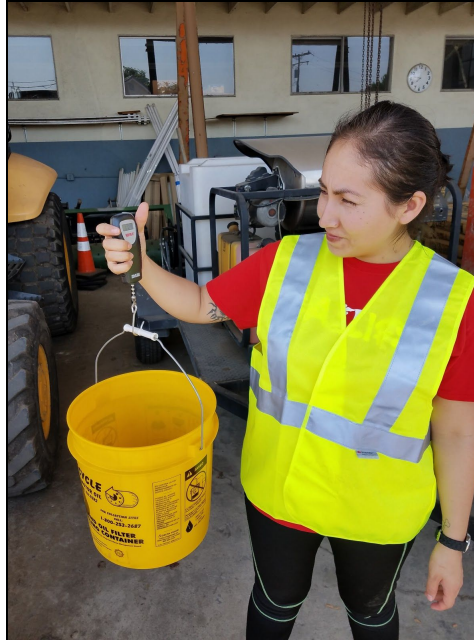
Figure 9. DGR crew member weighing collected trash using a digital scale.