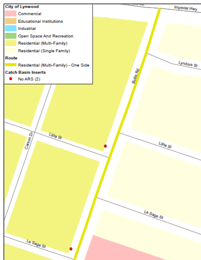
Figure 1. High Density Residential Area Route. Collection occurred Wednesday. Route includes the side of the street swept Thursday only.

Figures 1-6 show the collection routes for the DGR Study. Each figure includes a brief description.