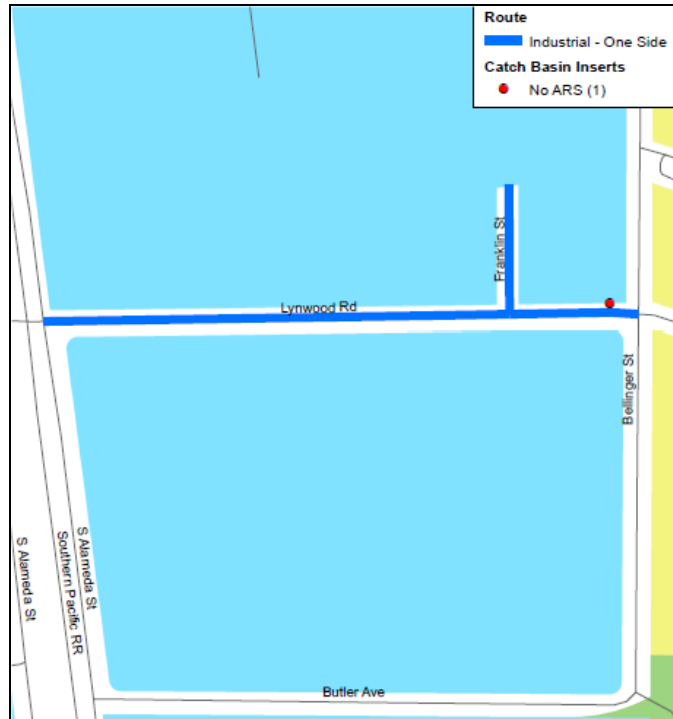
Figure 4. Industrial Area Route. Collection occurred Monday. Route includes the side of the street swept Tuesday only.