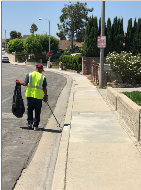
Figure 7. DGR crew member collecting trash using a reaching tool.

Figures 7-10 were taken during the 2017 DGR study. Each picture includes a brief description.