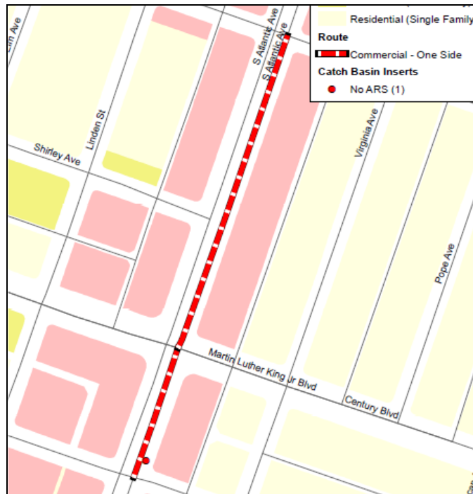
Figure 3. Commercial Area Route. Collection occurred Tuesday. Route includes the side of the street swept Wednesday only.