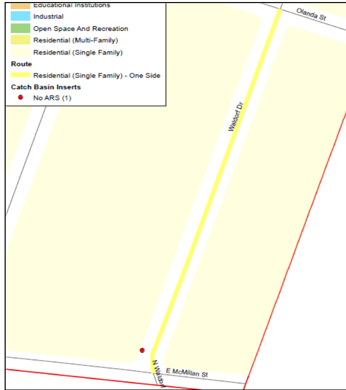
Figure 2. Low Density Residential Area Route. Collection occurred Wednesday. Route includes the side of the street swept Thursday only.