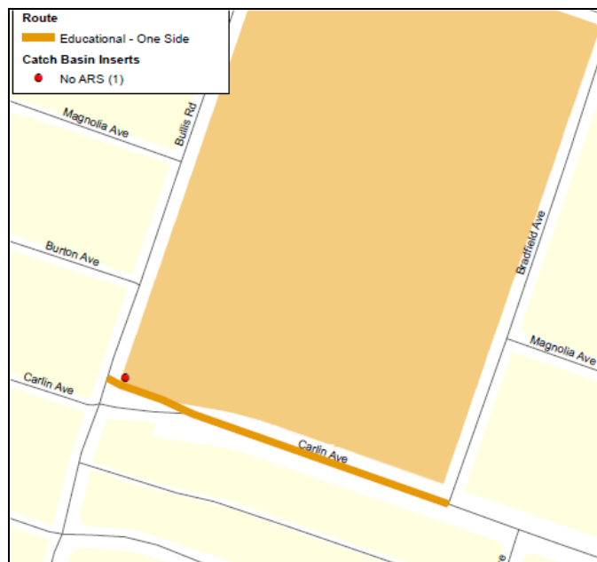
Figure 5. Public/Educational Area Route. Collection occurred on Wednesday. Route includes the side of the street swept Thursday only.