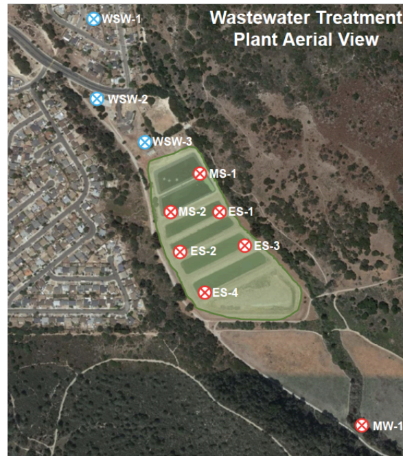
Figure B – Example aerial photograph of a Wastewater System. Location of water supply wells labeled with blue crosses. Location of monitoring well labeled with a red cross. Additional maps would be needed to show other system components.