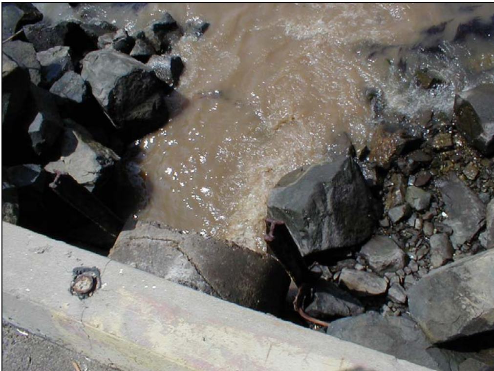
Water Main Break, at Maritime Museum, City of San Diego (2003) Bruce Reznik, San Diego Coastkeeper