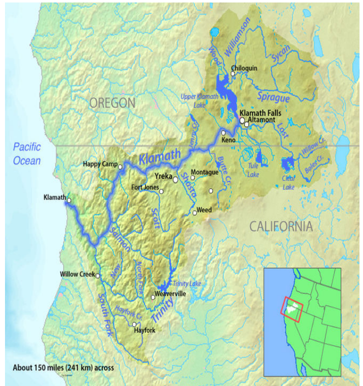
Map by Wikimedia.org/Wikipedia

Although Klamath River flow augmentation is scheduled to occur this year, the legal issues surrounding the flow releases have not yet been resolved. A trial date is expected to be set for October 2013, and the outcome of the trial will determine if flow augmentation via releases from Lewiston Dam will be allowed to occur in future years.