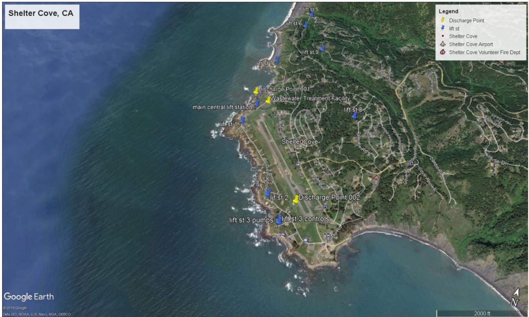
Figure B-1. Site Map