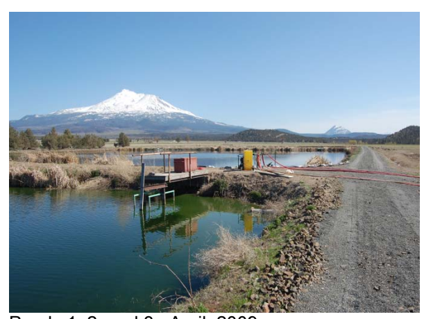
Ponds 1, 2, and 3. April, 2009.

Lake Shastina CSD incorporated in 1968 and operates a wastewater treatment facility (WWTF) currently serving 995 residences, the CSD offices, police and fire stations, and a golf course maintenance yard and restaurant. The WWTF has historically consisted of a solids containment structure followed by three wastewater percolation and evaporation ponds.