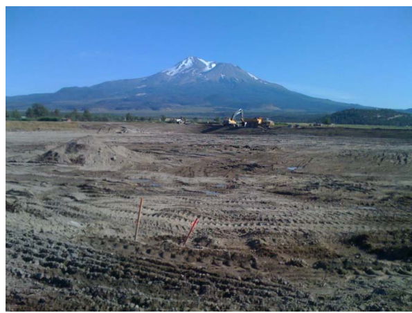
Grading of Ponds 4 and 5. September, 2011.

intends to increase treatment to enable agricultural reclamation of the effluent. Staff intend to have a draft WDR permit renewal before the Board in March, 2012.