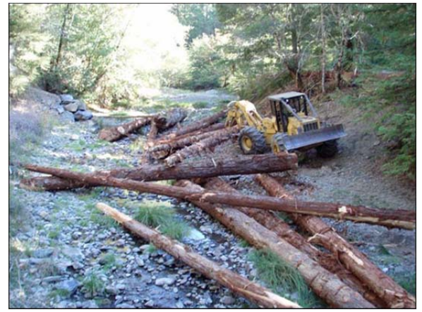
Inman Creek, Garcia River Watershed.

Significant efforts have been underway for several decades throughout various parts of the state to stop these downward population trends, including: upslope and instream restoration projects (e.g. barrier removal, stream bank stabilization, and fish habitat enhancement), best management practices (e.g. erosion and sediment controls, riparian setbacks, native vegetation planting, and invasive species removal), water management, and changes in regulations.