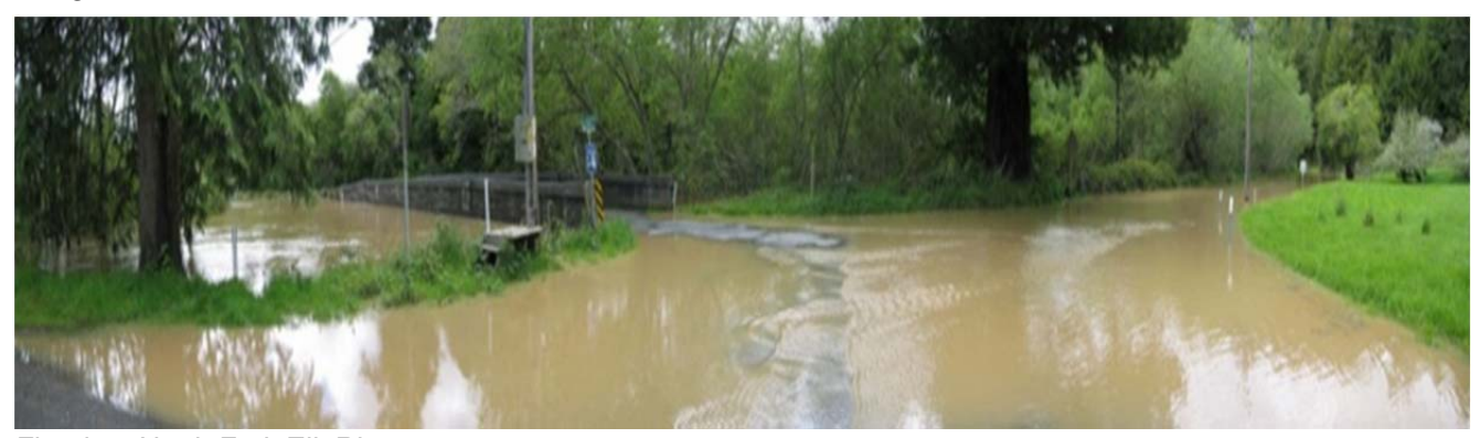
Flood on North Fork Elk River.

Invitees will include permitting and funding agency staff, affected landowners, and other interested individuals and groups. Staff look forward to Regional Water Board participation.