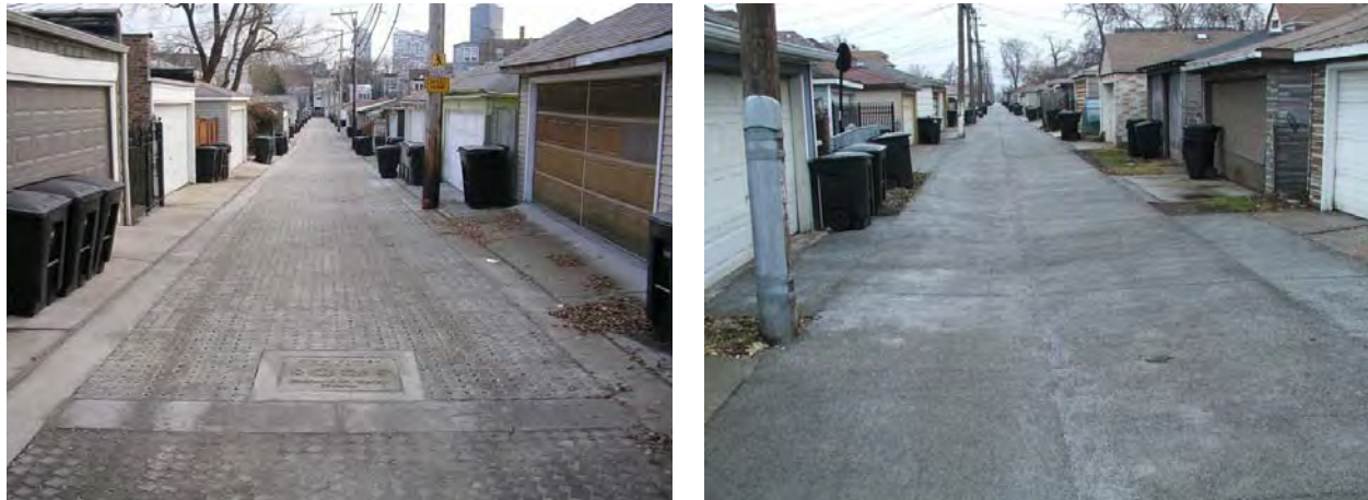
Figure 10: Permeable Pavers and Permeable Concrete Chicago Alleys

In 2006, when the Green Alley Program began, the city paid about $145 per cubic yard of permeable concrete. Just one year later, the cost of permeable concrete had dropped to only $45 per cubic yard. Compared with the cost of ordinary concrete, $50 per cubic yard, permeable concrete may have seemed like an infeasible option in the past to customers wanting to purchase concrete. 31 After the city's initial investment in the local permeable concrete market, the product cost has come down making permeable concrete a more affordable option for other consumers besides the city. This has resulted in an increased application of permeable concrete throughout the region.