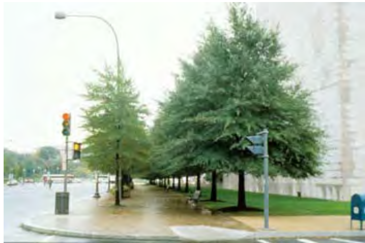
Figure 4. Trees planted at the same time but with different soil volumes, Washington DC

By providing adequate soil volume and a good soil mixture, the benefits obtained from a street tree multiply. To obtain a healthy soil volume, trees can simply be provided larger tree boxes, or structural soils, root paths, or “silva cells” can be used under sidewalks or other paved areas to expand root zones. These allow tree roots the space they need to grow to full size. This increases the health of the tree and provides the benefits of a mature sized tree, such as shade and air quality benefits, sooner than a tree with confined root space.