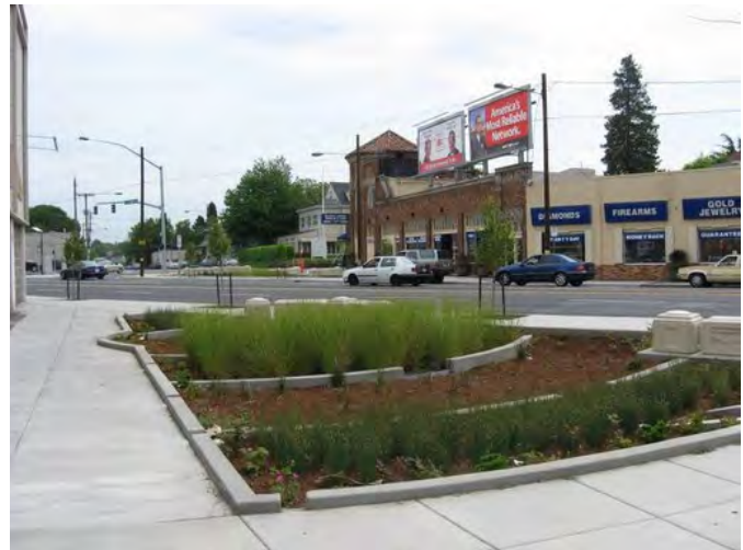
Figure 2. This bioretention area takes runoff from the street through a trench drain in the sidewalk as well as runoff from the sidewalk through curb cuts.

A few municipal DOT programs have instituted green street requirements in roadway projects, but as of yet, specifications for street bioretention have not yet been incorporated into municipal DOT specifications. Many cities do have street bioretention pilot projects; two of the well documented programs are noted in the table. Several concerns and considerations have prevented standard implementation of bioretention by DOTs.