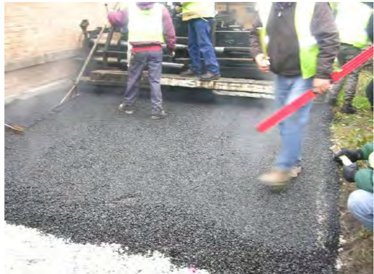
Figure 9: Permeable Asphalt Installation Using Ground Tire Rubber.

Four design approaches were created using these techniques. Based on the local conditions, the most appropriate approach is selected. In areas where soils are well-draining, permeable pavement is used. In areas where buildings come right up to the edge of pavement and infiltrated water could threaten foundations, impermeable pavement strips are used on the outside with a permeable pavement strip down the middle. In areas where soils do not provide much infiltration capacity, the alley is regraded to drain properly and impermeable pavement made with recycled materials is used. Another approach utilizes an infiltration trench down the middle of the alley. Light colored (high albedo) pavement, recycled materials, and energy efficient, glare reducing lights are a part of each design approach.