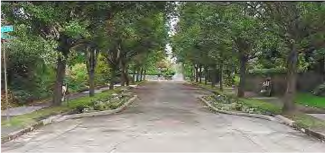
Figure 8: NE Siskiyou Vegetated Curb Extensions