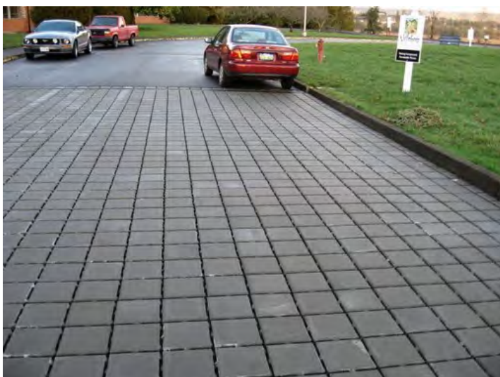
Figure 3. PerVIOUS pavers used in the roadway of a neighborhood development in Wilsonville, OR.

Of all the green streets practices, municipal DOTs have been arguably most cautious about implementing permeable pavements, though it should be noted that some DOTs have, for decades, specified open-graded asphalt for low use roadways because of lower cost; to minimize vehicle hydroplaning; and to reduce road noise. The reticence to implement on a large-scale, however, is understandable given the lack of predictability and experience behind impervious pavements. However, improved technology, new and ongoing research, and a growing number of pilot projects are dispelling common myths about permeable pavements.