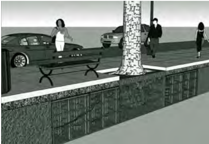
Figure 6. Silva cell structures support the sidewalk while providing root space for street trees (Source: Deep Root Partners, LP).