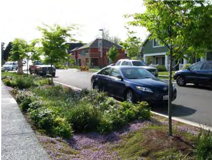
Figure 1. The street-side swale and adjacent porous concrete sidewalk are located in the High Point neighborhood of Seattle, WA (Source: Abby Hall, US EPA).

The Transportation Growth and Management Program of Oregon, through a Stakeholder Design Team, developed a guide for reducing street widths titled the Neighborhood Street Design Guidelines . 6 The document provides a helpful framework for cities to conduct an inclusive review of street design profiles with the goal of reducing widths. Solutions for accommodating emergency vehicles while minimizing street widths are described in the document. They include alternative street parking configurations, vehicle pullout space, connected street networks, prohibiting parking near intersections, and smaller block lengths.