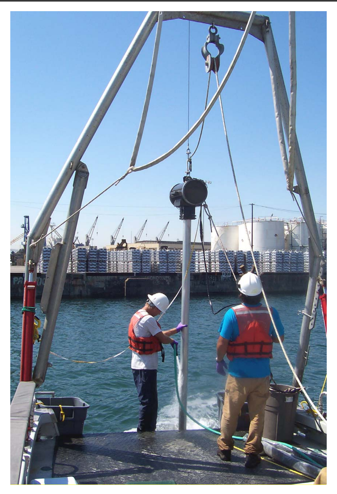
Figure 4. Electric Vibracore Sampler in Long Beach, California