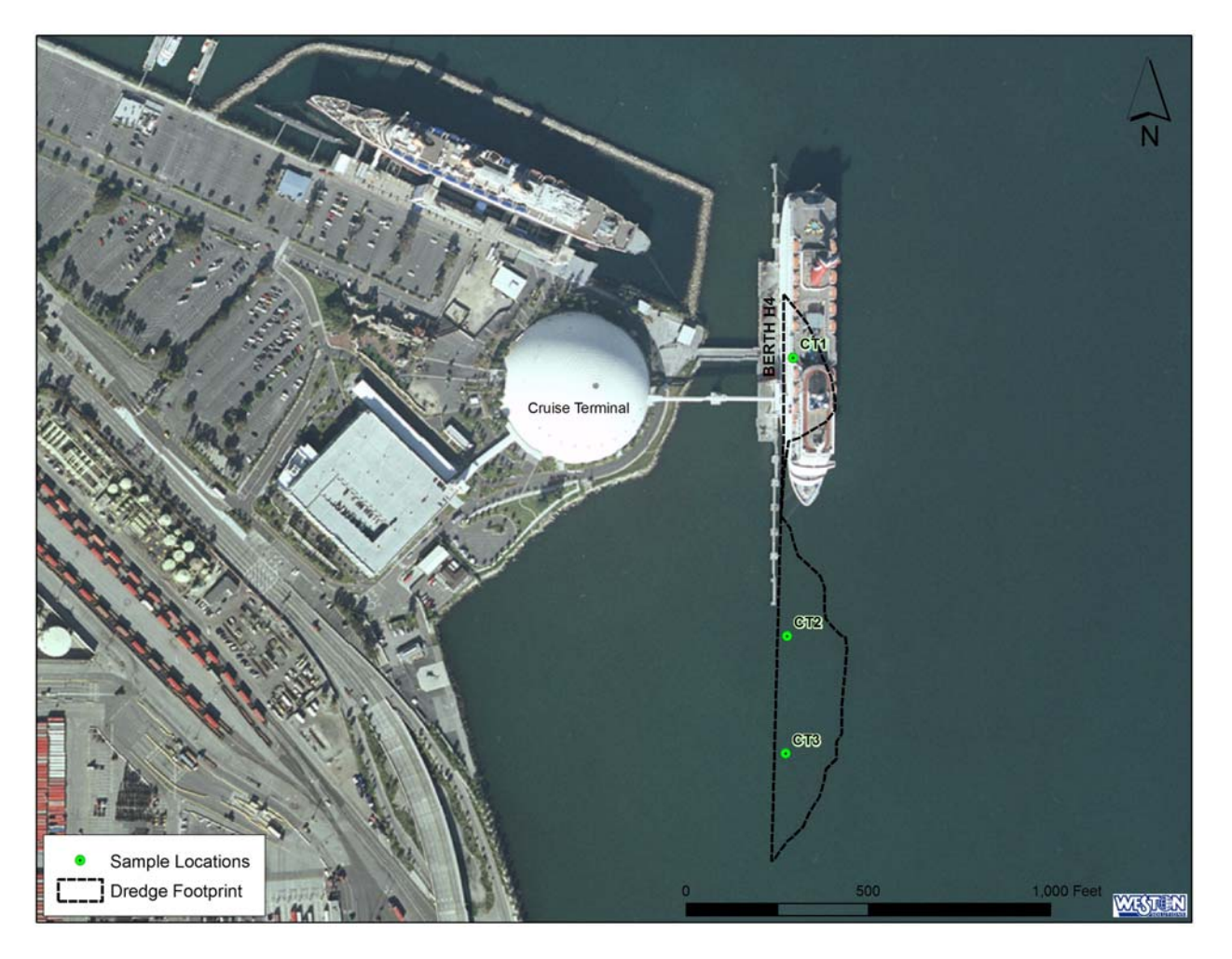
Figure 2. Cruise Terminal Project Area with Sampling Locations