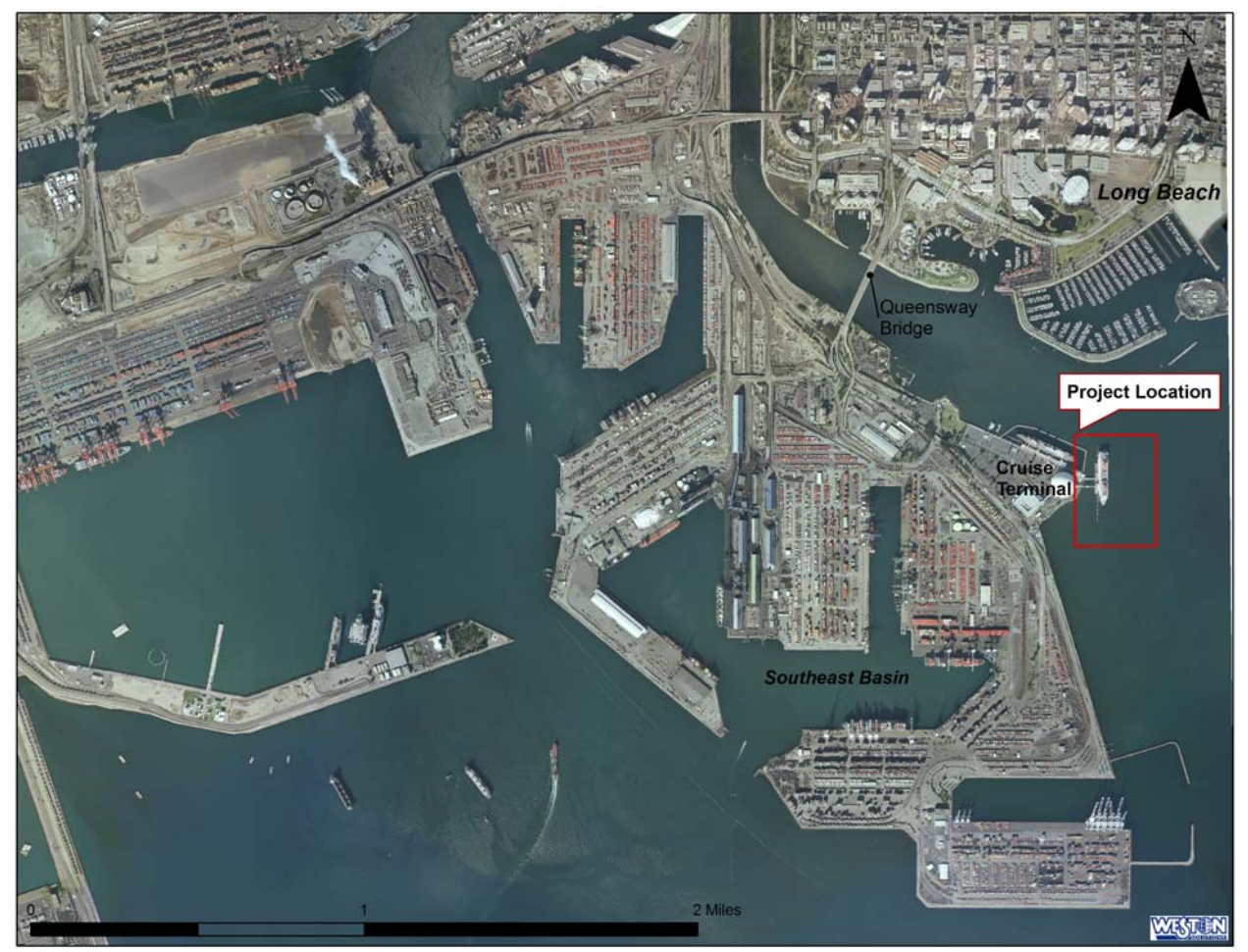
Figure 1. Overview of Sampling Area along the Carnival Cruise Terminal