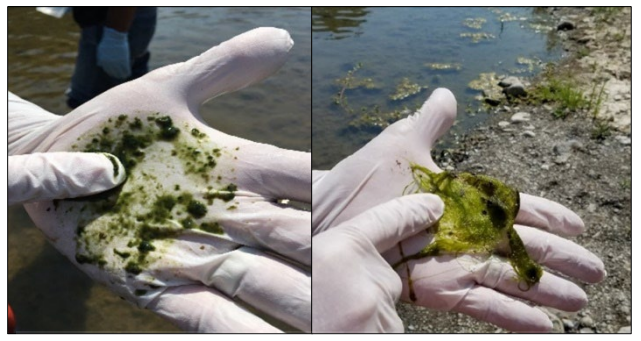
Photos show the difference between potentially non harmful algae (right) and harmful algae (left) while performing the gloved hand test.

Current research suggests that a warming climate is contributing to an increase in HAB growth, so it is important to be aware of what they look like and what steps to take when you encounter them. Sometimes the bloom is easily visible, forming a "scum" or discoloration on the water surface