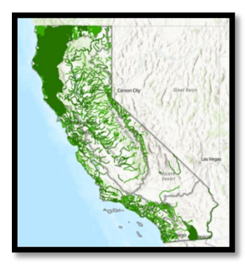
Click the above image to access the interactive Integrated Report Map.

Clean Water Act (CWA) Section 303(d) requires states to identify waterbodies that do not meet water quality standards. Waterbodies which do not meet water quality standards are placed on the CWA Section 303(d) List of Water Quality Limited Segments (also known as the list of impaired waterbodies, or the 303(d) list). Decisions to place waterbodies on the 303(d) list are governed by the Water Quality Control Policy for developing California's Clean Water Act