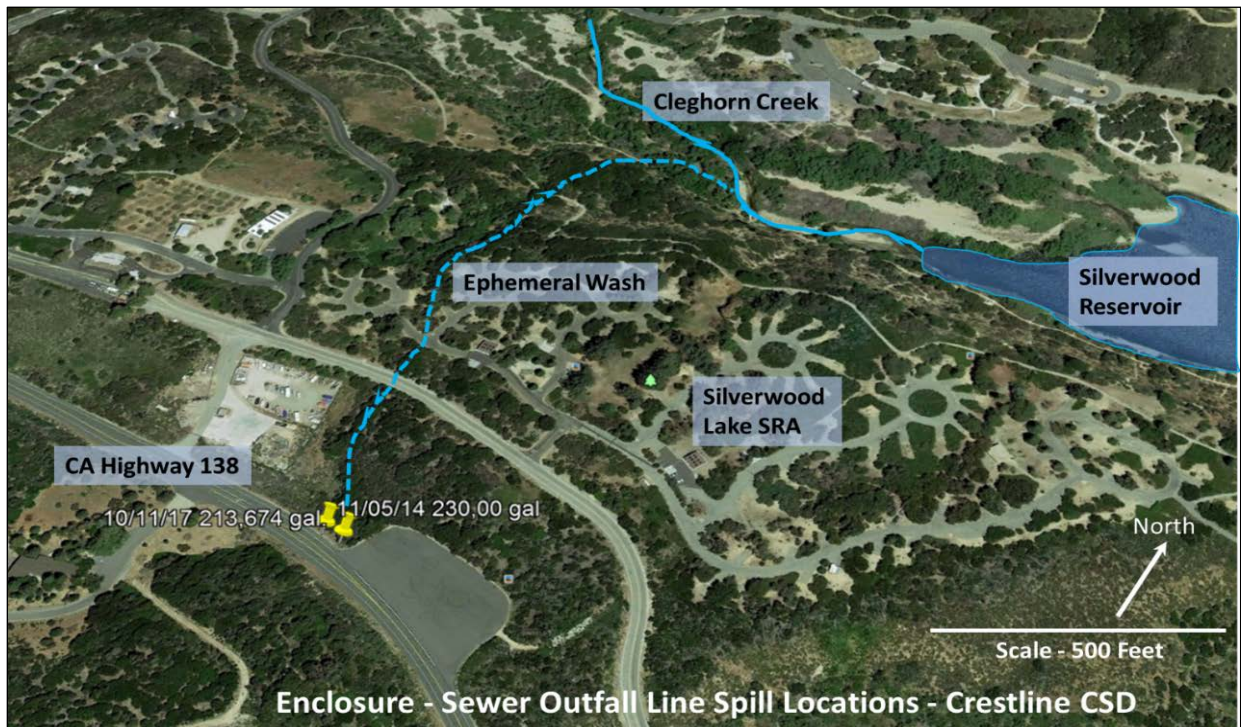
Location of two sewage spills from Crestline Sanitation District sewage outfall pipeline.