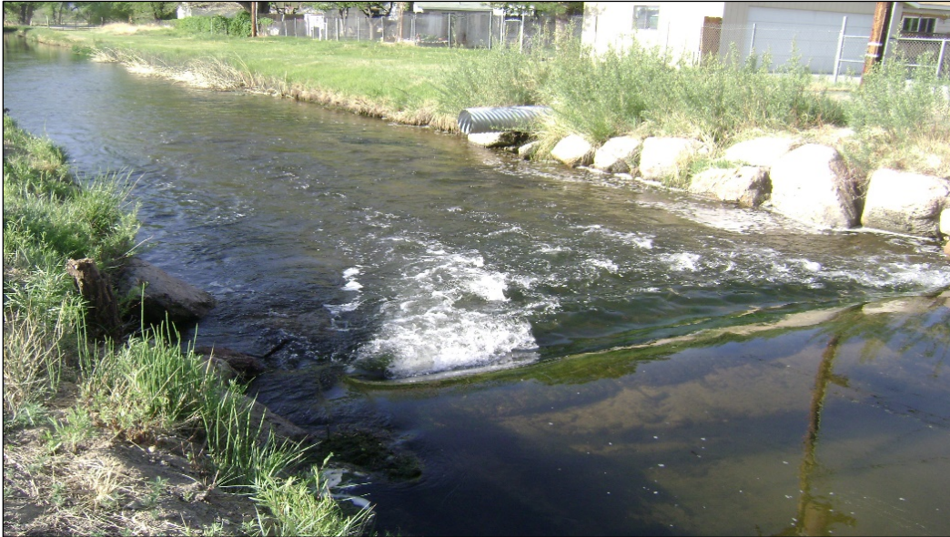
Photo showing concrete encased clay pipe submerged in water at a canal crossing. Bishop is looking to replace this 15-inch clay pipeline with a new 18-inch plastic pipeline.

A copy of the SSMP must be publicly available at the City's office and/or available on the internet and approved by the City's governing board.