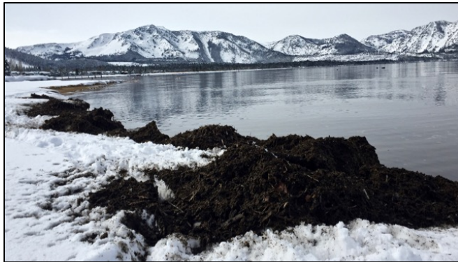
Figure 1 Rich soil covers the edge of the beach at Cove East.

“During this storm event our Tahoe Valley site, located off Tahoe Keys Boulevard, measured 1.5 million-cubic-feet of flow, nearly 90 percent of the flow that was observed throughout the whole 2016 water year,” Sarah Bauwens with TRCD said in a statement.