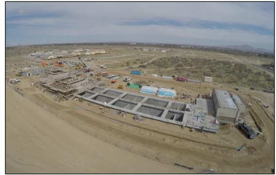
Above - Hesperia Sub-Regional Plant

The VVWRA currently operates one Regional Water Reclamation Plant that is producing and delivering disinfected tertiary recycled water for irrigation and for cooling purposes. The Apple Valley and Hesperia Sub-Regional Reclamation Plants are under construction and are scheduled for performance testing in the second quarter 2017 for the Hesperia plant and fourth quarter 2017 for the Apple Valley plant. These plants will soon be ready to deliver local tertiary treated recycled water within their jurisdictions.