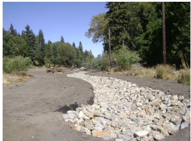
Photo 1: View looking downstream along constructed Hooks Creek channel. Photo taken October 4, 2016.

The “meadow restoration,” as currently designed and constructed by the Natural Resources Conservation Service (NRCS), directs flows through a narrow rock-lined channel and series of sediment basins, essentially replacing what was once unconfined sheet flow across the 100+ acre Hencks Meadow (photo 1). This design may actually dewater the meadow not restore it. Staff has other concerns including the planned uses of the meadow with connected walking trails and new and existing hiking and biking trails. So where do we go from here? The next critical step for the developer is finalizing CEQA before the TUP expires in April 2017, otherwise the park will close if an extension is not granted by the County. For