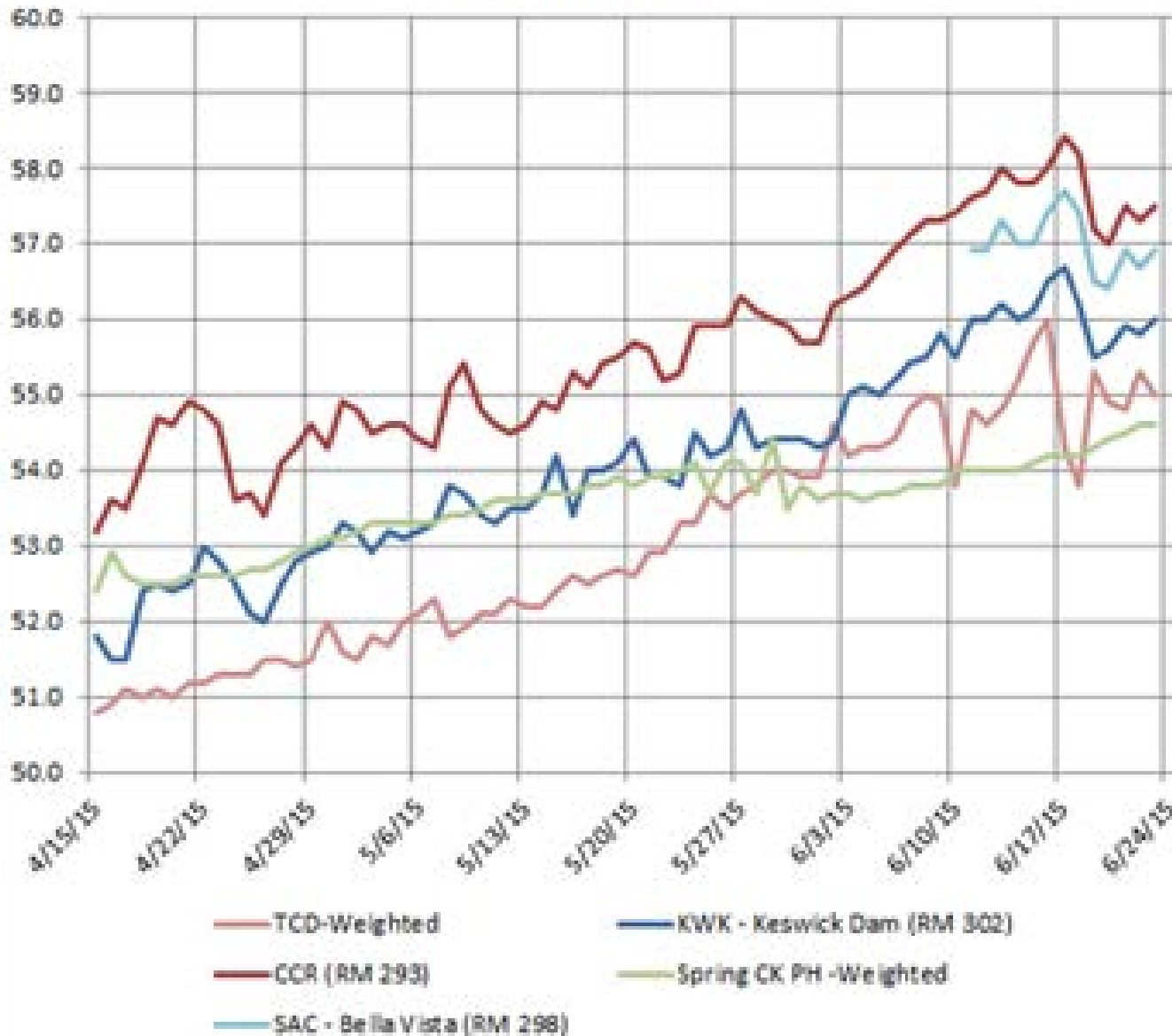
Average Daily Water Temperatures Data from CDEC and USBR Temperature and Release Summary for Shasta and Trinity Report