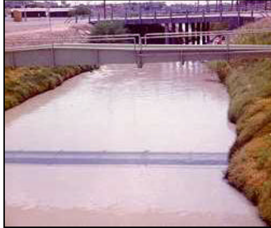
Figure 23: Discharge from a soap factory caused this discoloration of the New River at International Boundary (Aug 1975)

On February 12, 1976, notification was received from the Mexican government that treatment works for Mexicali were to be built without regard to cost on a priority basis, and that, by July 1976, works would provide for collection and treatment of 90 percent of the city's sewage. Upon completion of these works, efforts would be concentrated on collection and treatment of the other 10 percent of the untreated sewage discharged into the New River.