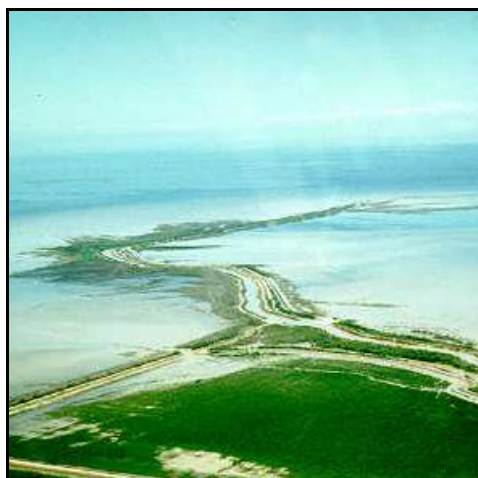
Figure 36: New River emptying into Salton Sea (Aug 1977)

On June 15, 1976, the Imperial Irrigation District Board of Directors 1 adopted Resolution No. 37-76 which requested "the assistance of all recipients of this Resolution in encouraging the Country of Mexico to consider diverting into the Laguna Salada [2] area of Baja California a major