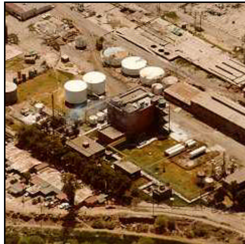
Figure 37: Soap factory (Apr 1978)