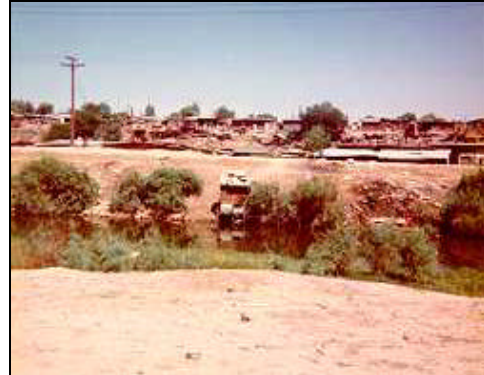
Figure 18: Outhouse over the New River (Aug 1975) 3

On June 26, 1975, a binational inspection of the Mexicali sewerage facilities was coordinated by IBWC. 1 It was noted that the South Collector was still under construction and should be completed in about a year. The Mexican officials explained that Mexico was seeking a loan from the World Bank to complete the diversion of all untreated sewage from the New River. Effluent from the stabilization ponds was being discharged into the New River and not being used for irrigation as originally proposed. It was explained to the Mexican officials that under U.S. EPA regulations, United States communities are required to provide secondary treatment of wastewater prior to discharge. Stabilization ponds were considered to provide only primary treatment. 2