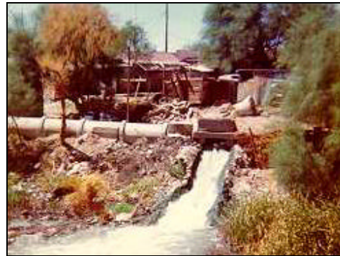
Figure 19: Raw sewage spill from North Collector (Aug 1975)