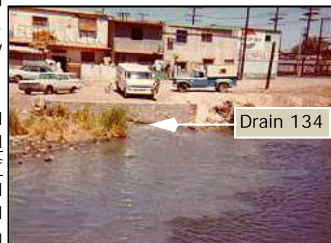
Figure 17: Drain 134 (Aug 1975)