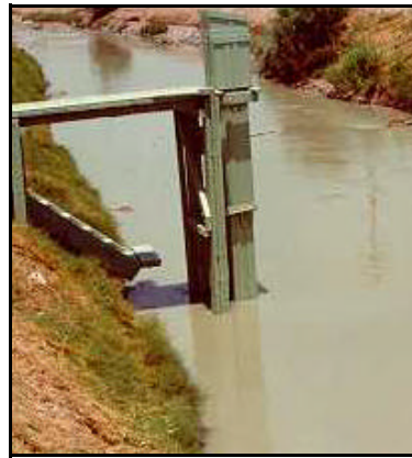
Figure 40: Slug from soap factory (Aug 1975)

"These conditions are generally associated with a substantial increase in COD, BOD, suspended and settleable solids, and turbidity of the river water. The dissolved oxygen content is usually depressed and the pH is variable.