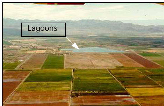
Figure 38: Overview of Mexicali's sewage treatment lagoons (Apr 1978)

On October 26, 1977, the State Board advised the Governor's Office of steps that might be taken to alleviate the problems in Mexicali. The State Board recommended that the Mexican government be offered technical assistance and possibly federal grants for continuing efforts. Also recommended was support of negotiation through the IBWC for specific agreements to establish water quality standards for the New River at the International Boundary. The two most serious problems to be addressed were said to be breakdowns in the sewer system and direct discharge of untreated industrial wastes.