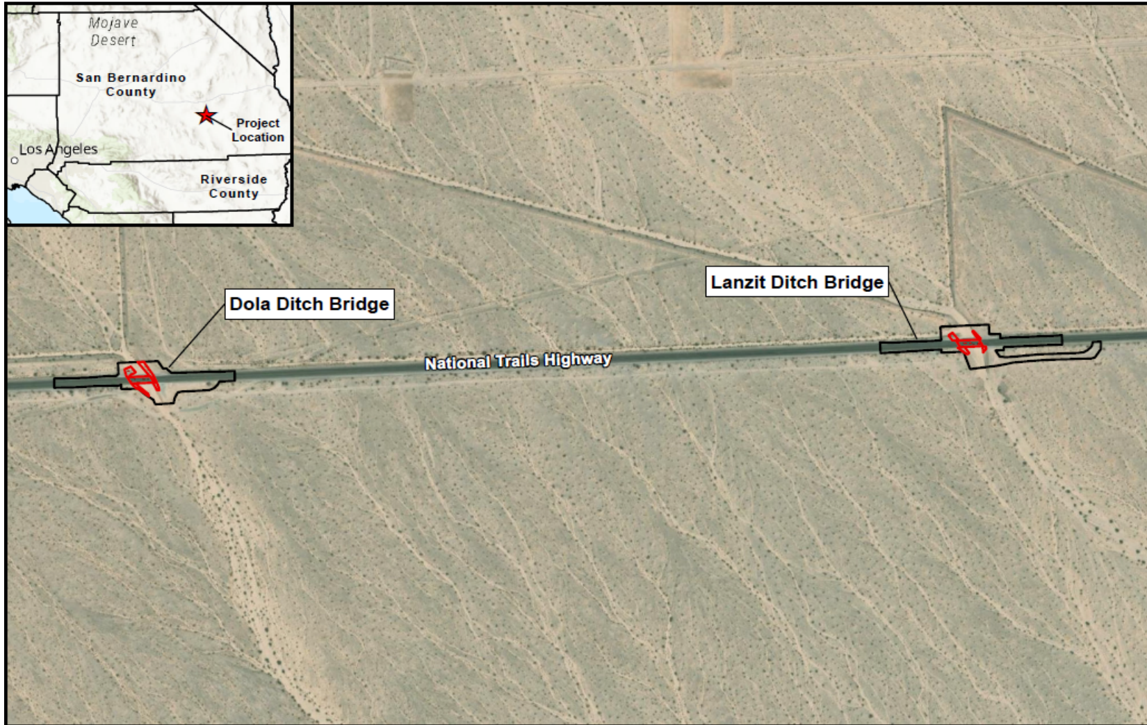
Figure 2: Project Location