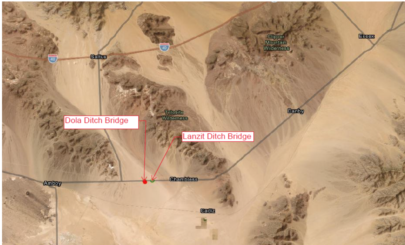
Figure 1: Vicinity Map 9