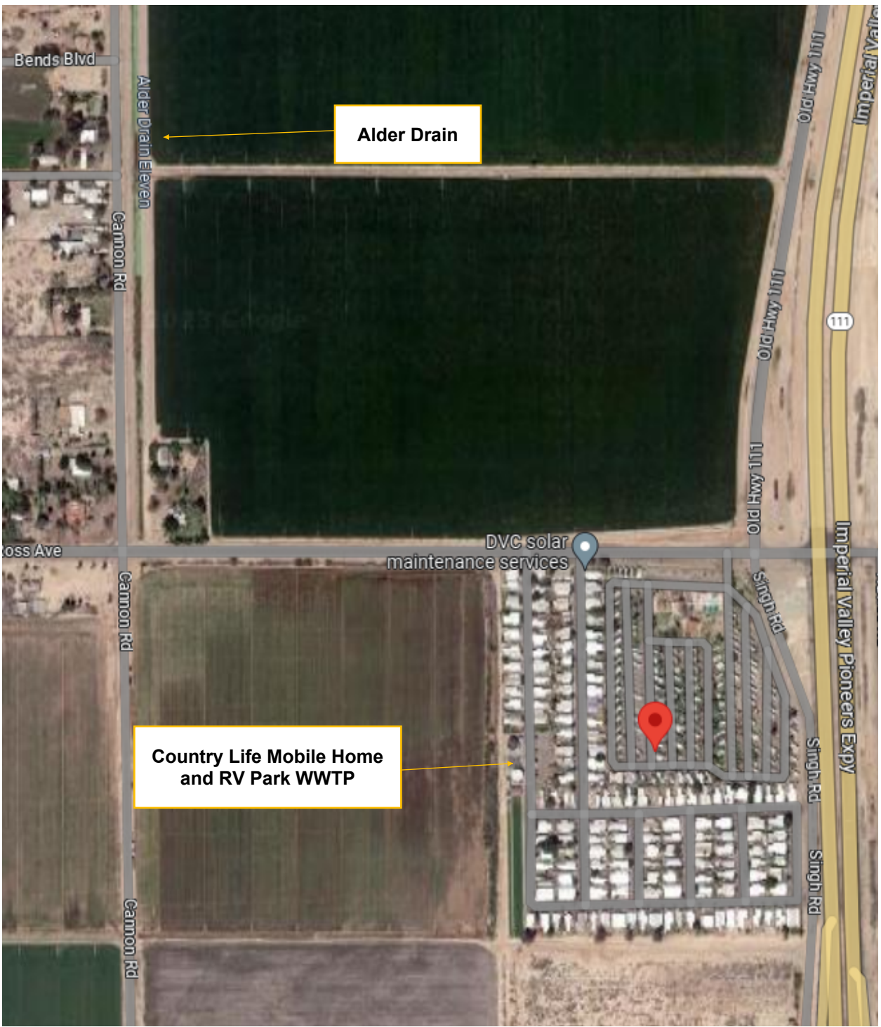
Country Life Mobile Home and RV Park Wastewater Treatment Plant