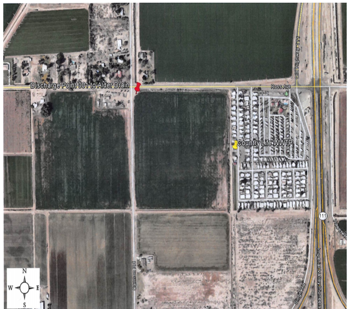
Country Life MHRVP Asset Partners, L.P. Country Life Mobile Home and RV Park Wastewater Treatment Plant East of El Centro - Imperial County Facility Location – NE ¼ of Section 10, T16S, R14E, SBB&M Discharge to Alder Drain - 32?46' 53" N; 115?30' 33" W