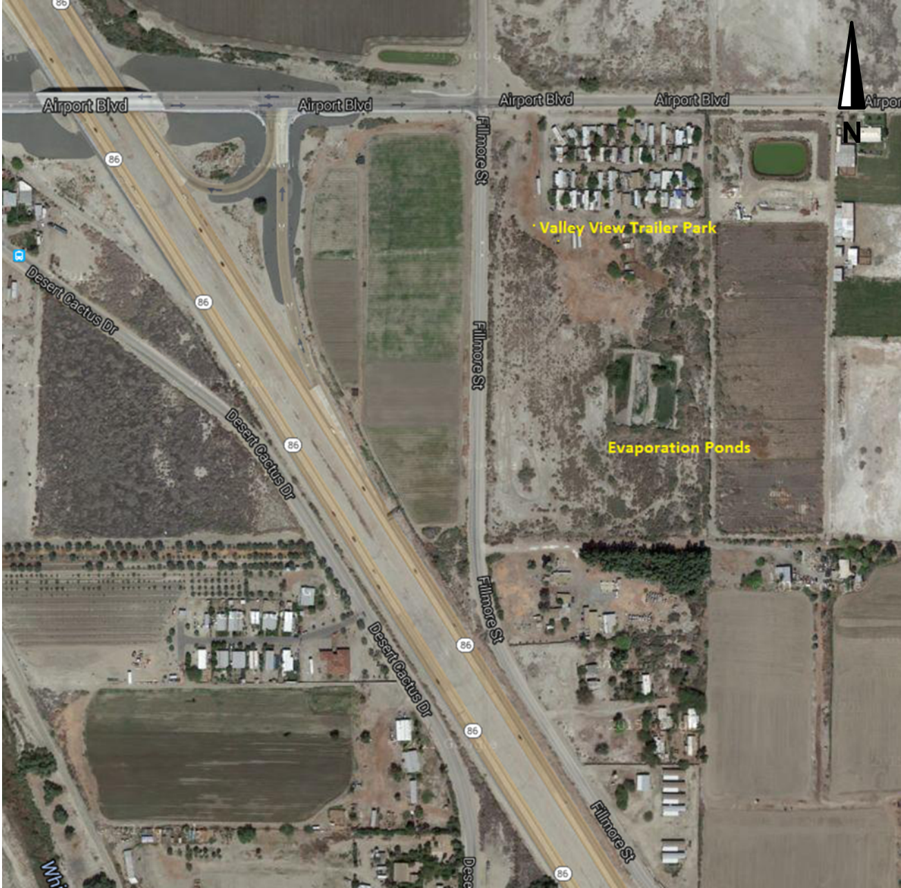
VICINITY MAP VALLEY VIEW TRAILER VILLAGE DOMESTIC WASTEWATER TREATMENT SYSTEM Thermal - Riverside County